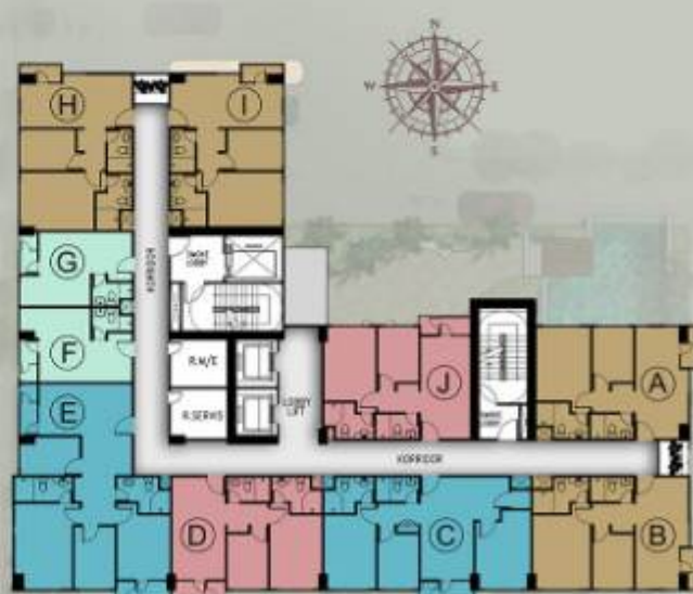
RESIDENT TYPICAL PLAN 8 23 FLOOR

We want only the best for the elites of Medan City. Plenty of apartment types to choose from, Studio, 2BR, 3BR and 4BR