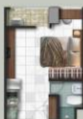
1 BEDROOM TYPE F TYPE G (MIRROR) SM Gross 29.29m 2