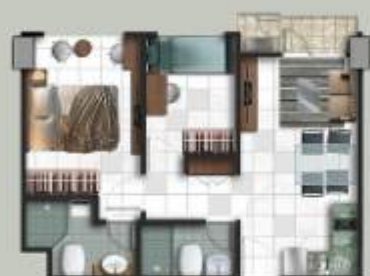
2 BEDROOM TYPE D & J SM Gross 60.42m 2