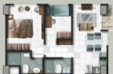
2 BEDROOM TYPE A & H TYPE B & I (MIRROR) SM Gross 62.71m 2