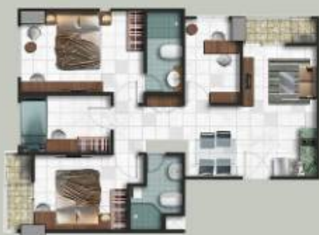
4 BEDROOM TYPE E SM Gross 98.55m 2