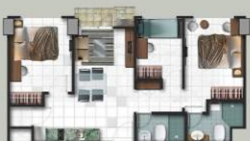
3 BEDROOM TYPE C SM Gross 82.80m 2