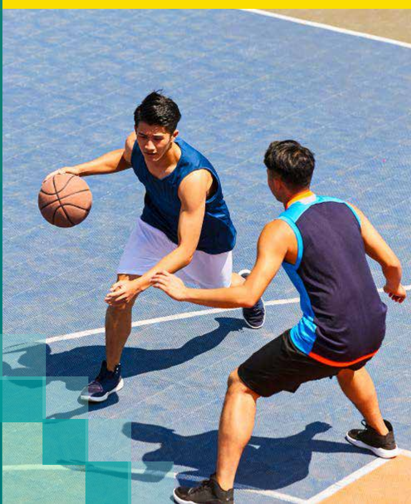
ADAPTABLE OUTDOOR COURT