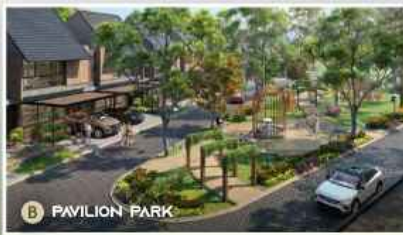
B PAVILION PARK