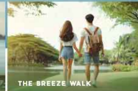
THE BREEZE WALK