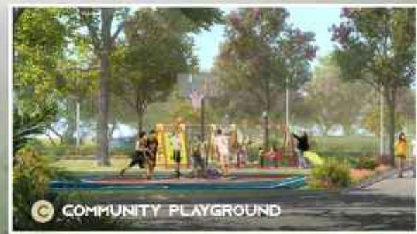
C COMMUNITY PLAYGROUND