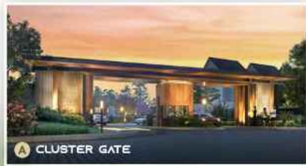
A CLUSTER GATE