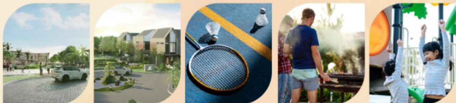
Town Center & Club House