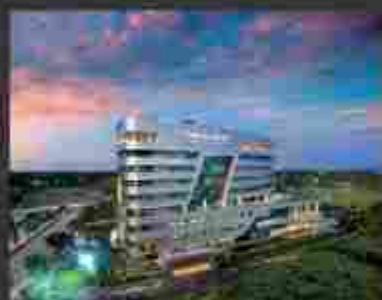
ALAMAH SAKIT PONDOK INDAH BINTARO JAYA