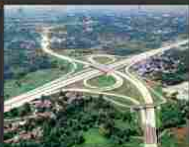
SIMPANG SUSUN TOL PARIGI