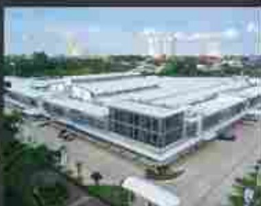
FRESH MARKET BINTARO JAYA