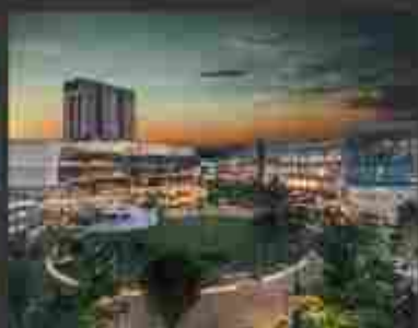
BINTARO JAYA XCHANGE MALL