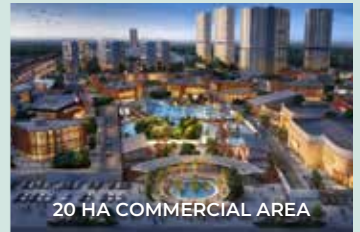
20 HA COMMERCIAL AREA