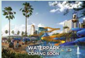
WATERPARK COMING SOON