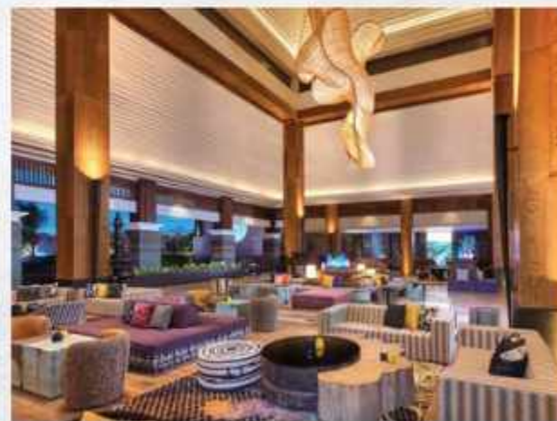
RENAISSANCE HOTEL BALI