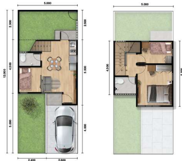
▲ 1 st Floor