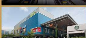
Living Plaza Jababeka