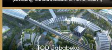
TOD Jababeka (Future Development)