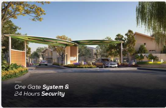
One Gate System & 24 Hours Security