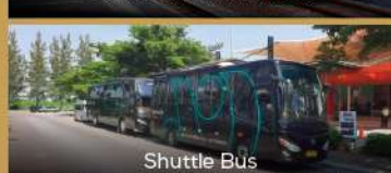
Shuttle Bus (Bandung, Bandara Soekarno Hatta, Blok M)