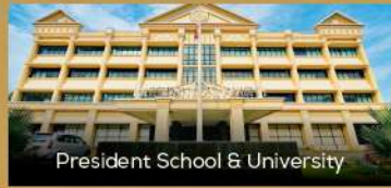
President School & University