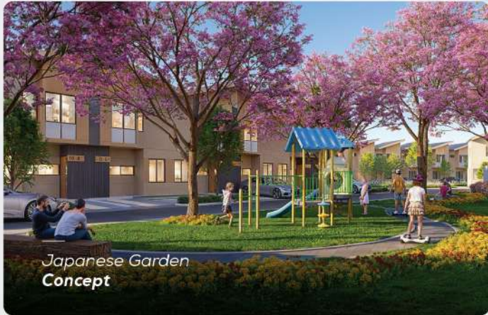
Japanese Garden Concept