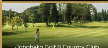
Jababeka Golf & Country Club