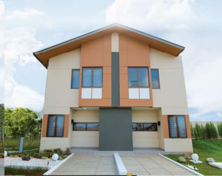
Ibuki Hakusan -白山-