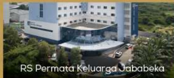
RS Permata Keluarga Jababeka