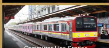
Commuter Line Station