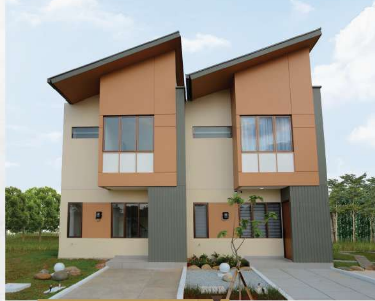
Ibuki Fujisan -富士山-