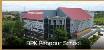
BPK Penabur School