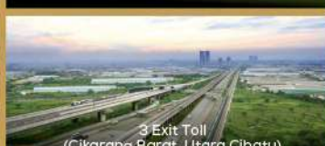
3 Exit Toll (Cikarang Barat, Utara, Cibatu)