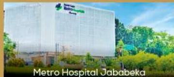
Metro Hospital Jababeka