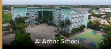
Al Azhar School