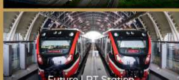
Future LRT Station