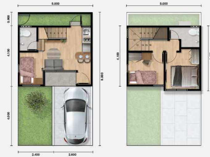
▲ 1 st Floor