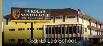
Santo Leo School