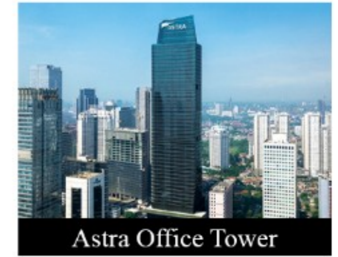
Astra Office Tower