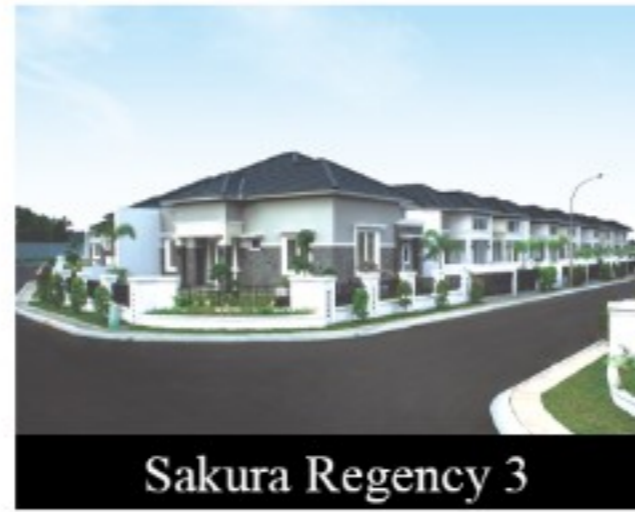
Sakura Regency 3