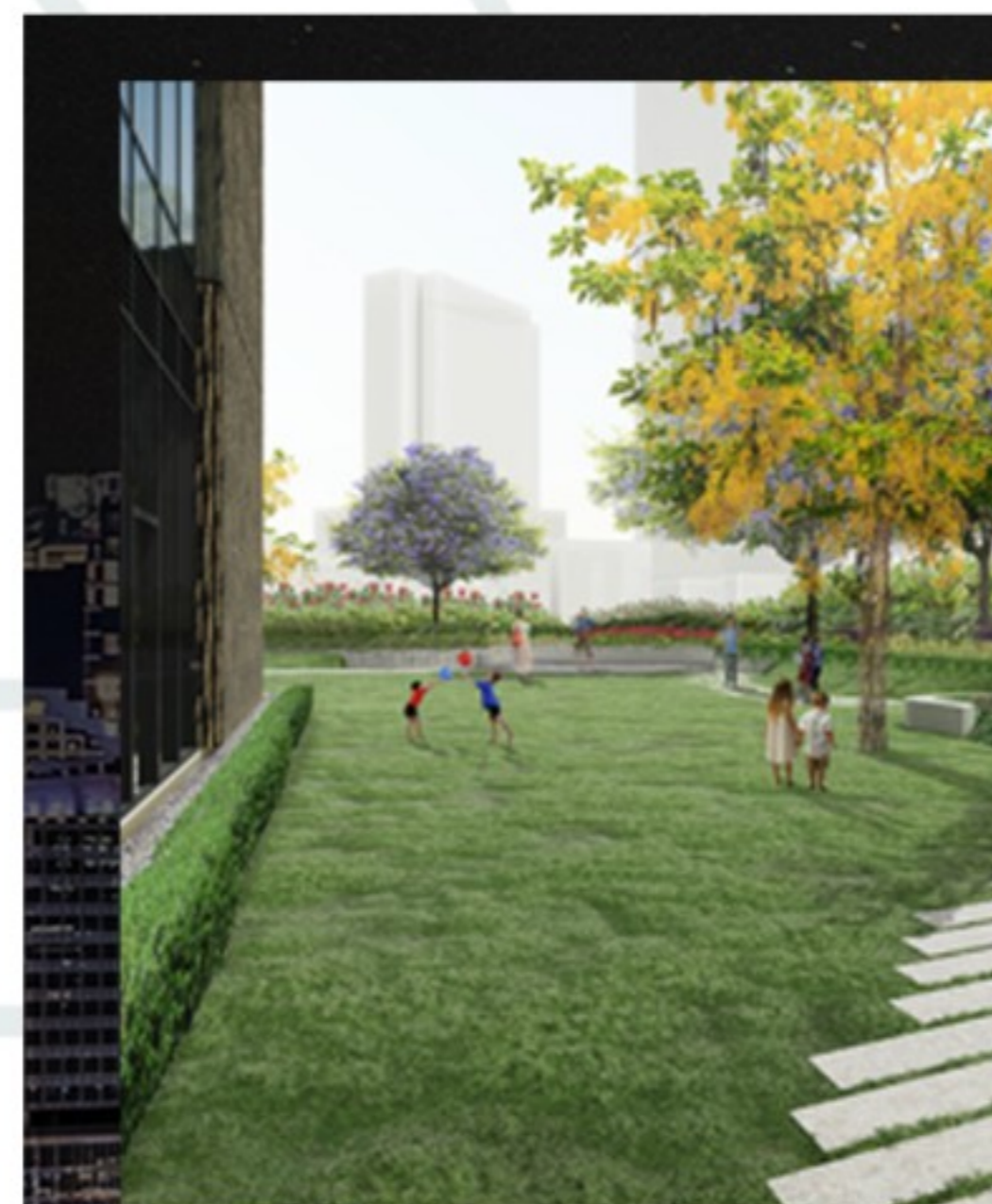
Retail Main Garden