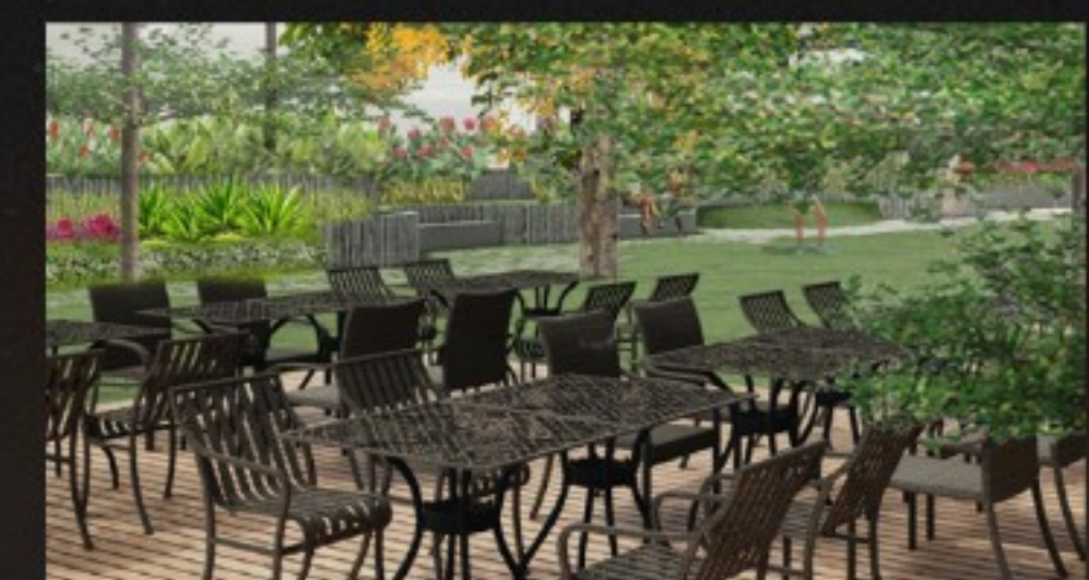
Retail Terrace Garden