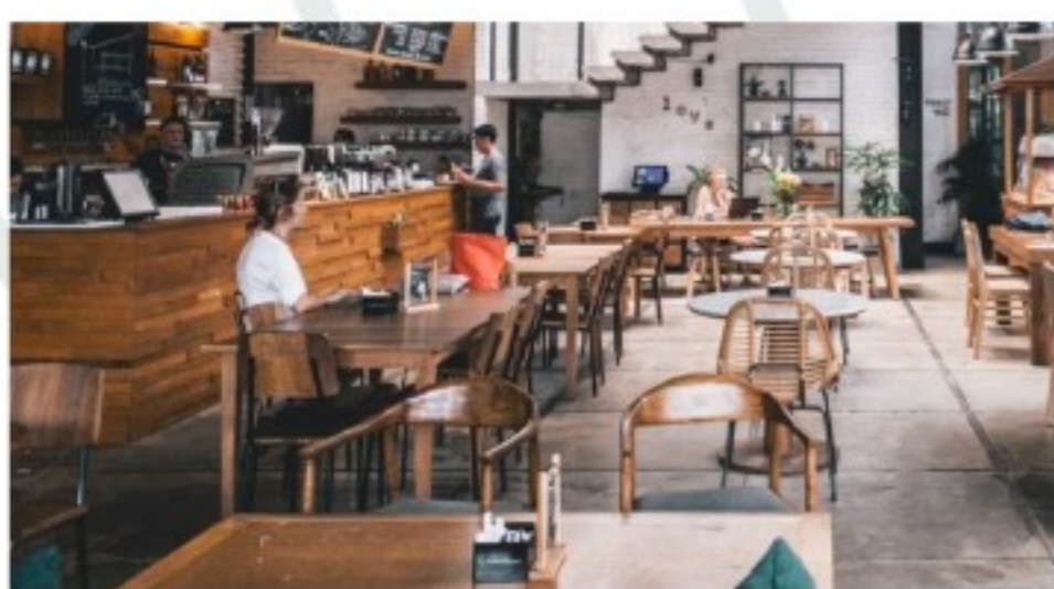
Cafe & Coffee Shop