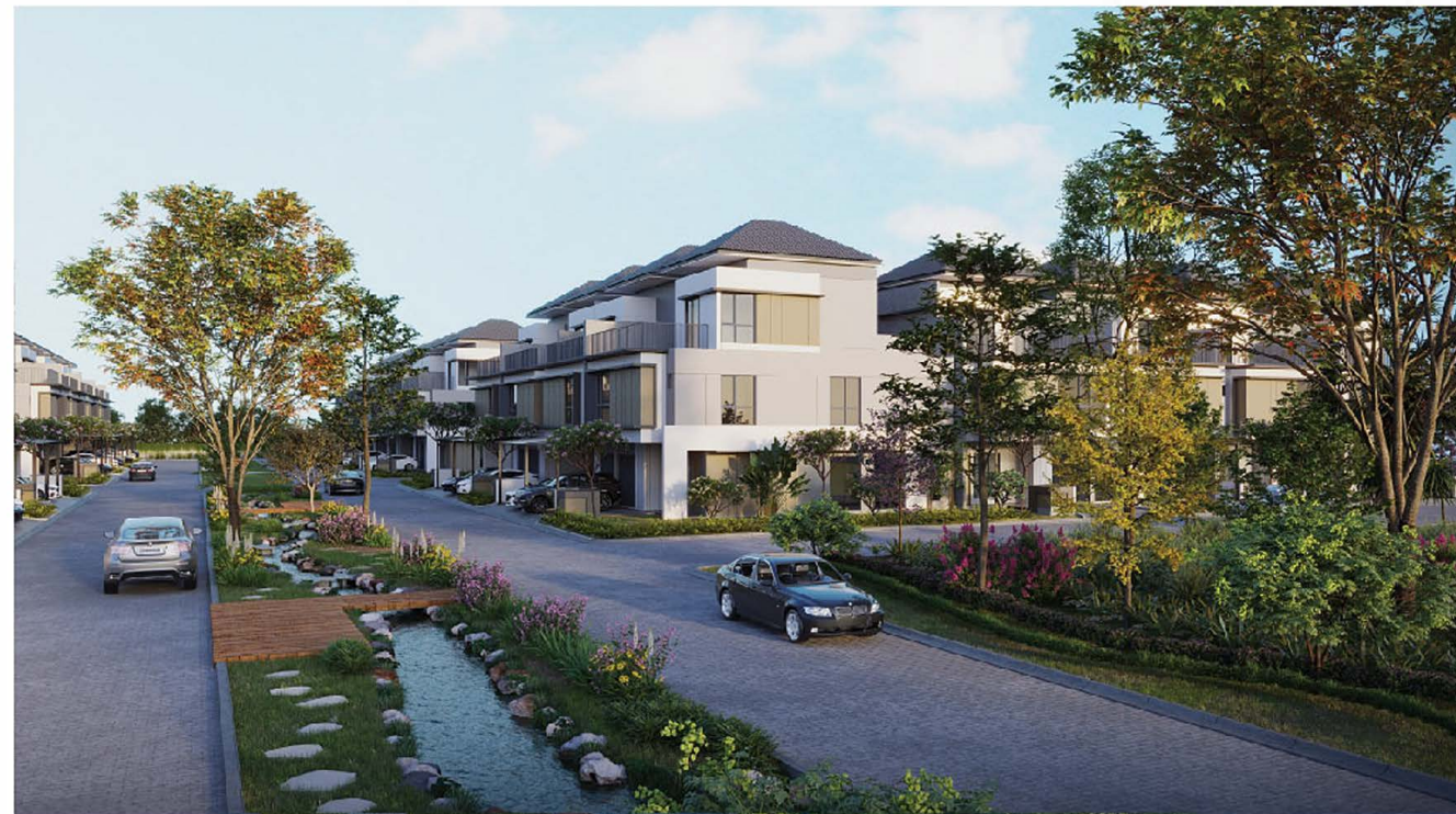
Lavatera Vibrant Avenue