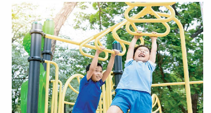
Enjoy the playground at Lavatera

The cluster gate and beautiful floral plaza at the entry welcome you to Vibrant Avenue, surrounded by green connectivity and gathering spaces. Lavatera Community Plaza across Vibrant Avenue provides a perfect spot for a chat or tea with family and friends.