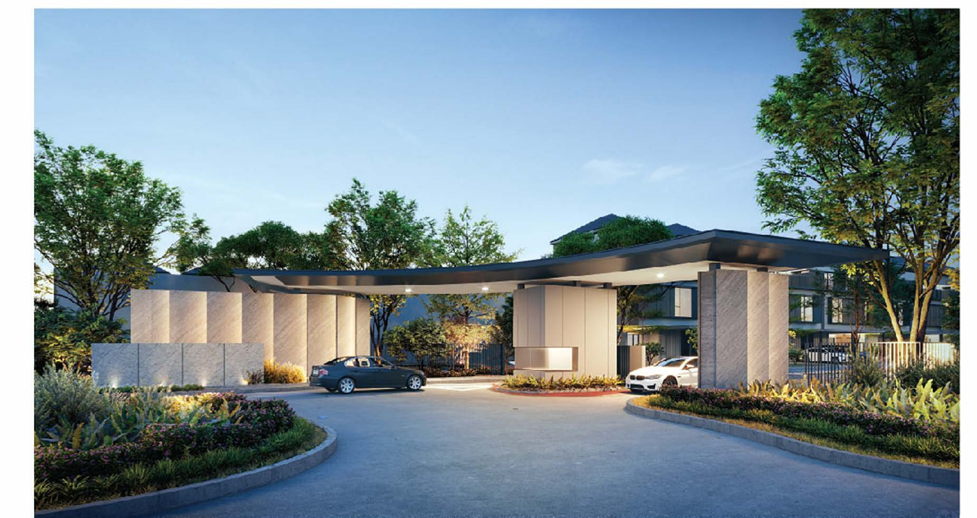
Cluster gate at Lavatera

Lavatera, the first cluster of the Ammaia Ecoforest, offers a vibrant living experience with a diverse landscape of colorful plants, trees, and flowers that promote regional biodiversity and cleaner air.