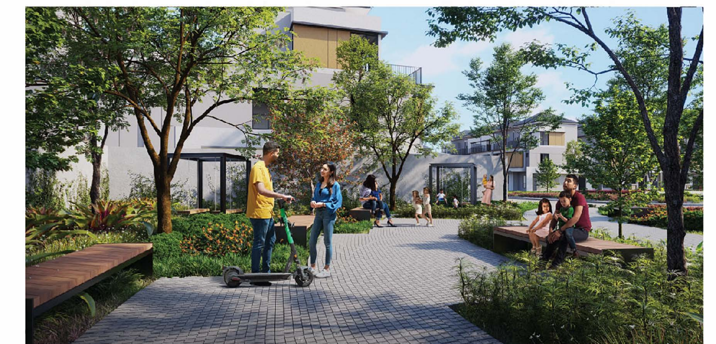
The beautiful scenery of Floral Plaza