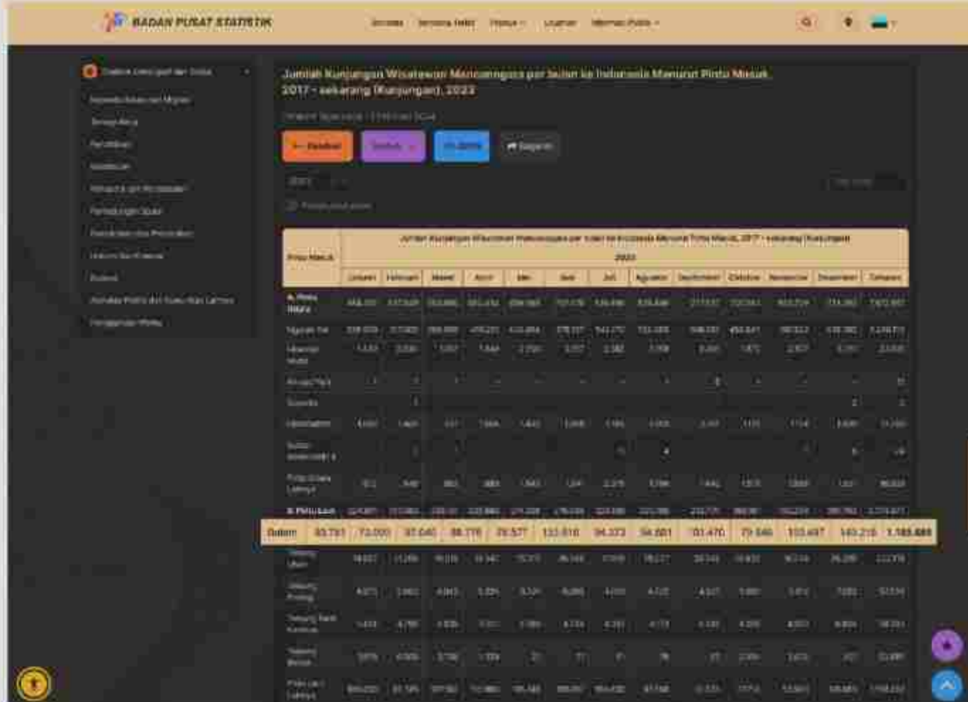
Shows the growth in foreign visitor numbers from 2017 to December 2023 according to the four main entrances.