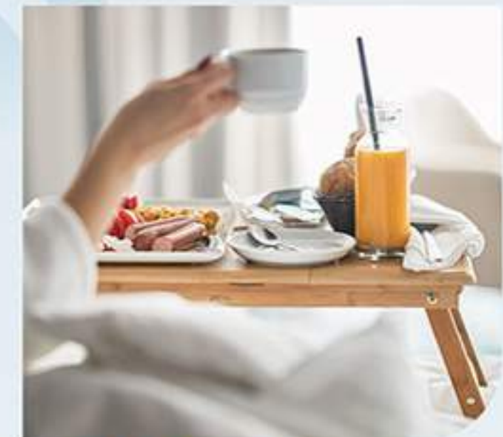
FIVE STAR HOTELS