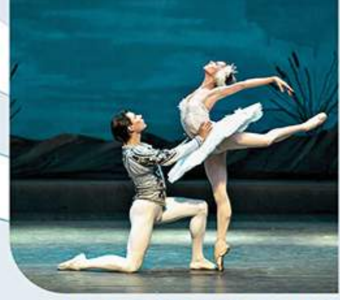
ART GALLERY AND THEATER