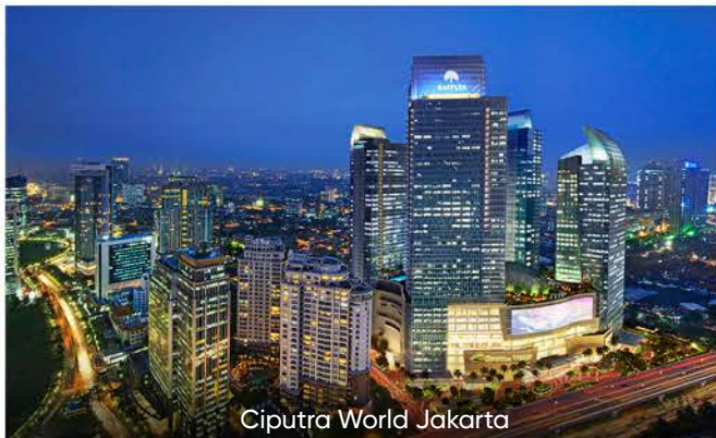
Ciputra World Jakarta