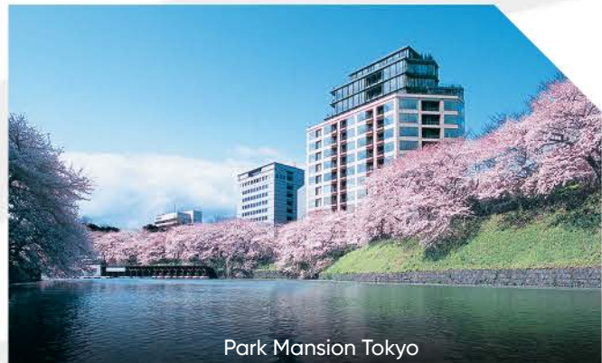
Park Mansion Tokyo