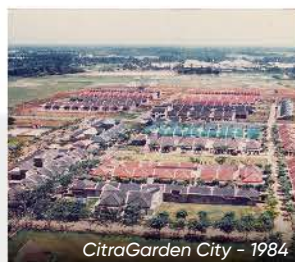
CitraGarden City - 1984