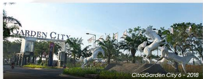
CitraGarden City 6 - 2018