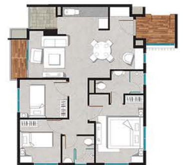
No. 05 & 11 - 3 Bedroom Semi-gross : 94.47 sqm