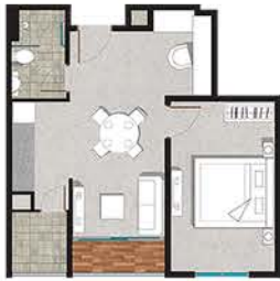
No. 07 - 1 Bedroom Semi-gross : 58.68 sqm