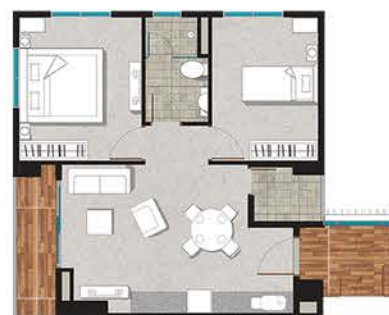
No. 06, 07, 12 & 15 - 2 Bedroom Semi-gross : 70.65 sqm