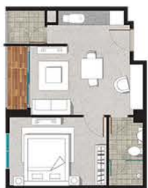
No. 03 & 09 - 1 Bedroom Semi-gross : 54.59 sqm