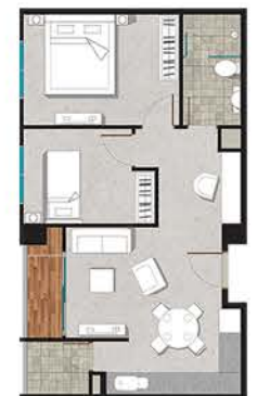
No. 05 & 11 - 2 Bedroom Semi-gross : 69.50 sqm