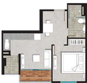
No. 02 - 1 Bedroom Semi-gross : 47.32 sqm