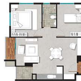
No. 06 & 10 - 2 Bedroom Semi-gross : 79.23 sqm