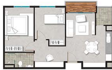
No. 02 & 08 - 2 Bedroom Semi-gross : 76.71 sqm