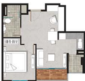
No. 09 - 1 Bedroom Semi-gross : 52.89 sqm