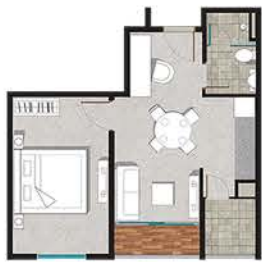
No. 01 - 1 Bedroom Semi-gross : 54.38 sqm