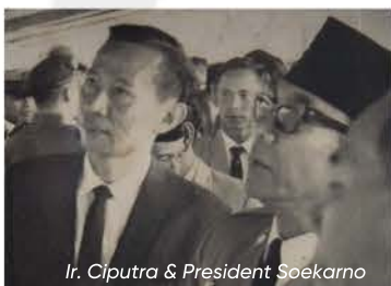
Ir. Ciputra & President Soekarno

As a company marking over seventy years since its founding. With innovation as its cornerstone, Mitsui Fudosan has consistently read the trends of the times while developing new markets.