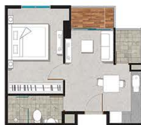
No. 01, 03, 08 & 10 - 1 Bedroom Semi-gross : 48.96 sqm