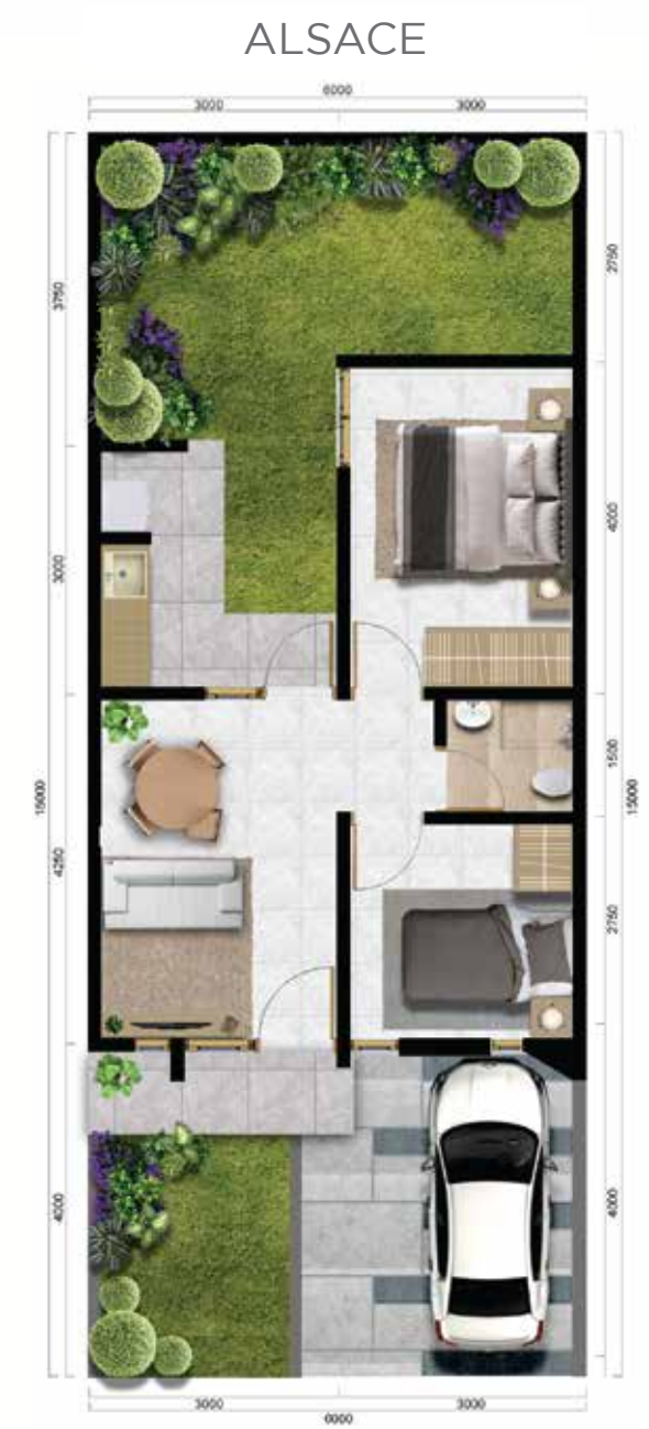
LB / LT : 42 M2 / 90 M2 ( 6 X 15 )