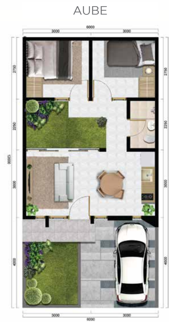
LB / LT : 39 M2 / 72 M2 ( 6 X 12 )