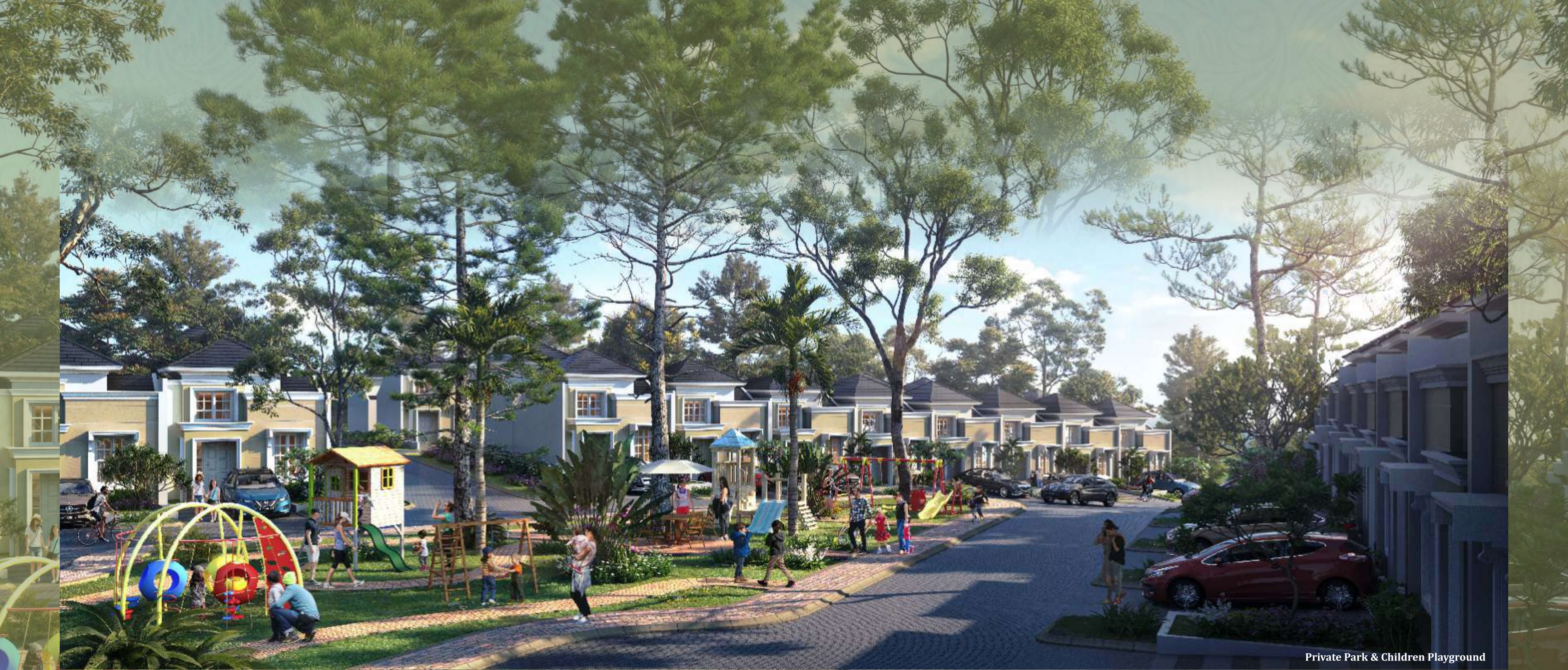
Private Park & Children Playground