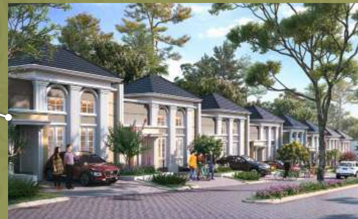
Boulevard ROW 15