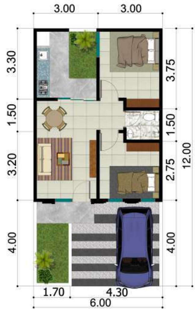
LB 42m 2 / LT 72m 2 (6X12)