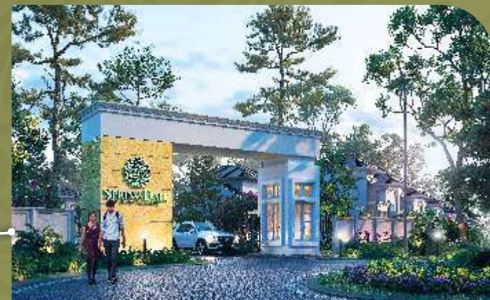
Gate Cluster Spring Dale