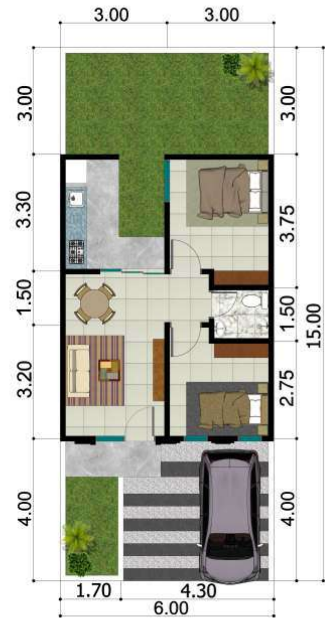
LB 42m 2 / LT 90m 2 (6X15)