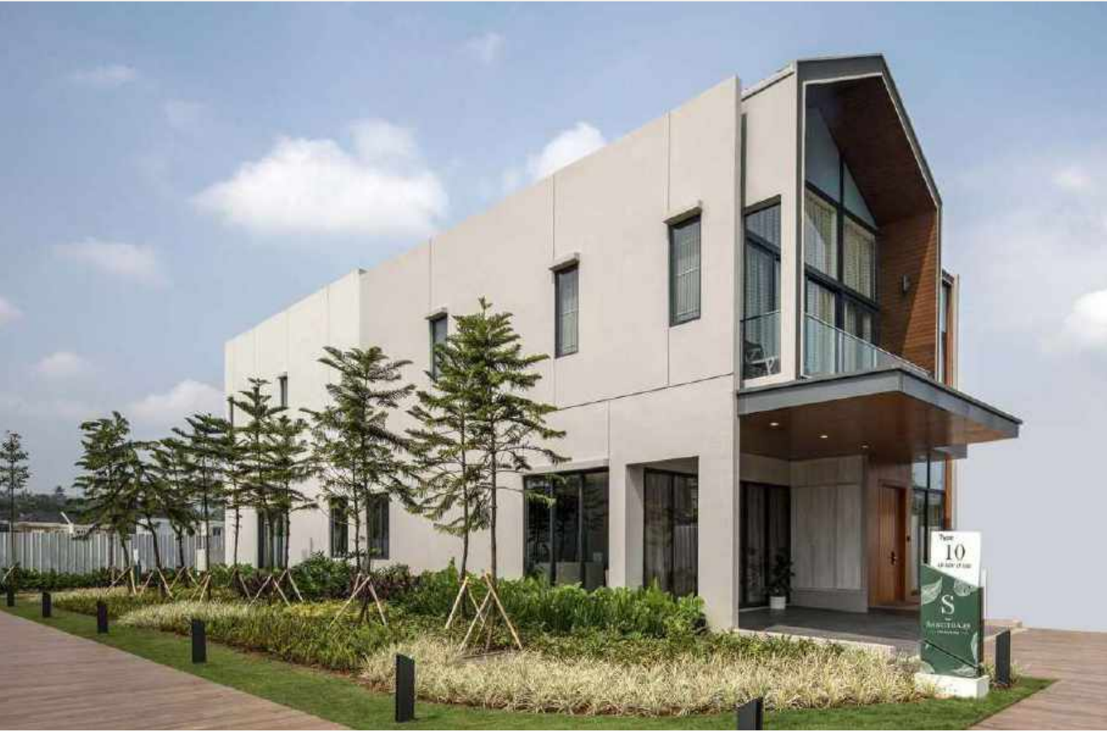
Tanglin Parc at The Sanctuary Collection