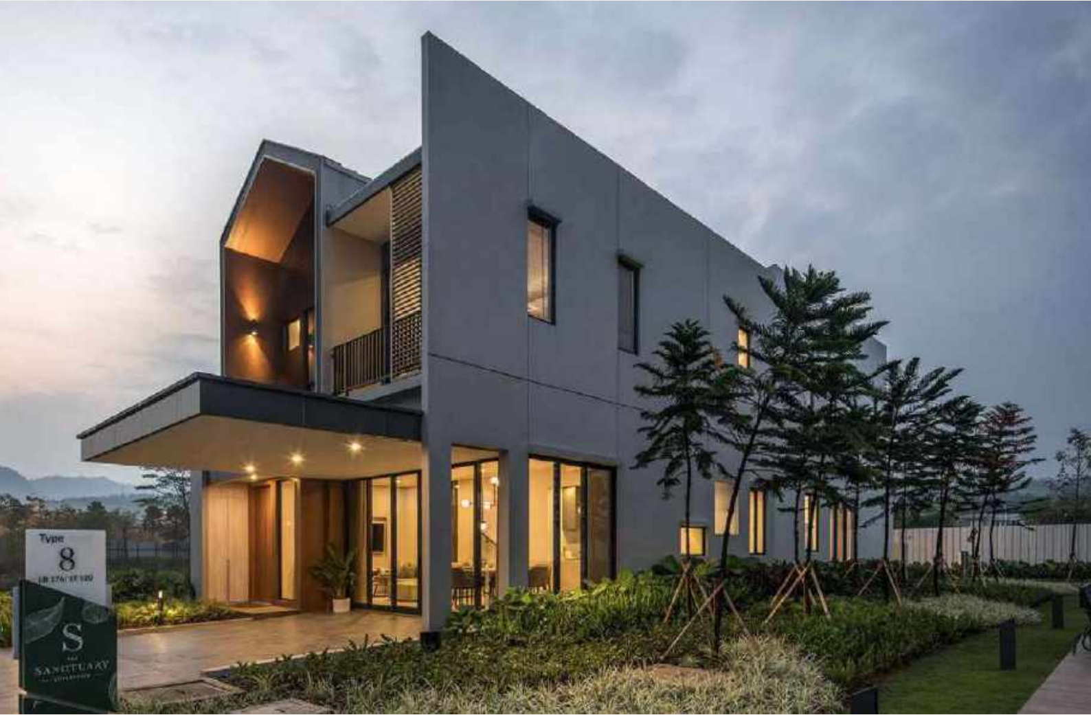
Tanglin Parc at The Sanctuary Collection