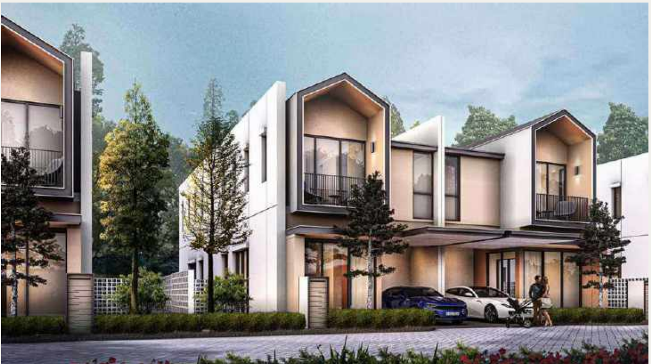
Tanglin Parc at The Sanctuary Collection