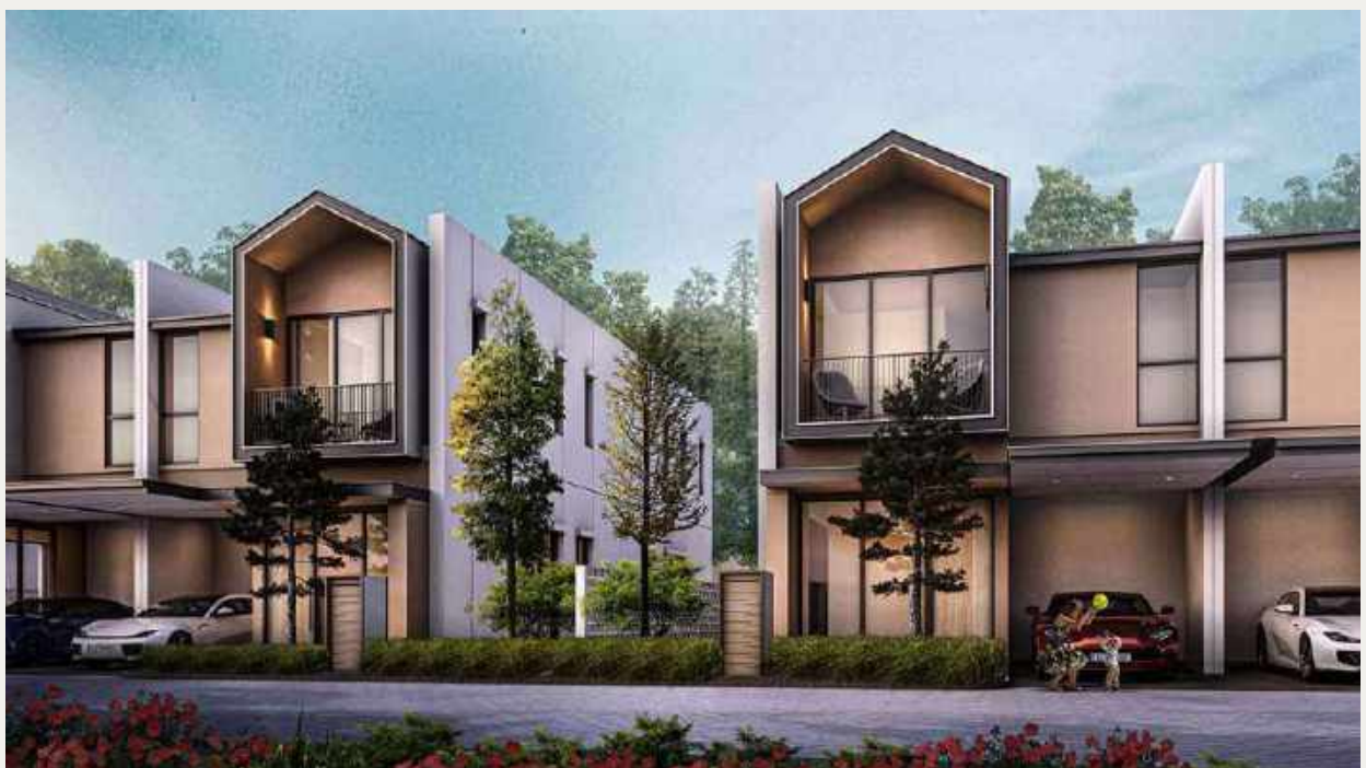
Tanglin Parc at The Sanctuary Collection