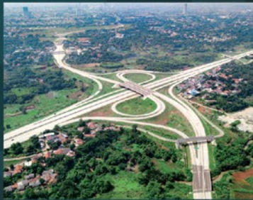
SIMPANG SUSUN TOL PARIGI