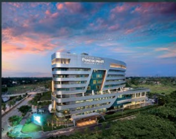
RUMAH SAKIT PONDOK INDAH BINTARO JAYA