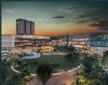
BINTARO JAYA XCHANGE MALL