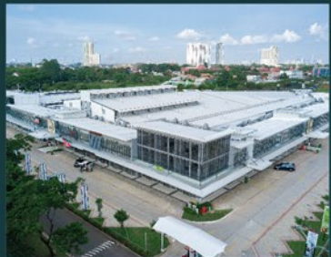
FRESH MARKET BINTARO JAYA