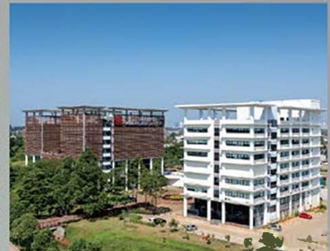
UNIVERSITAS PEMBANGUNAN JAYA