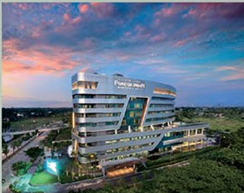
RUMAH SAKIT PONDOK INDAH BINTARO