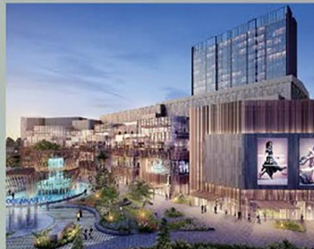
BINTARO XCHANGE MALL