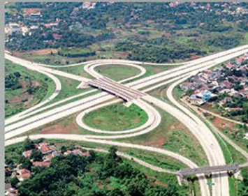
TOL SIMPANG SUSUN PARIGI