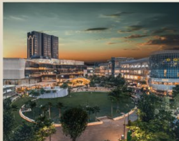
BINTARO JAYA XCHANGE MALL TAHAP 2