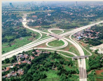
SIMPANG SUSUN TOL PARIGI