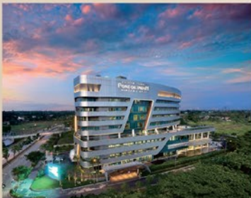
RUMAH SAKIT PONDOK INDAH BINTARO JAYA