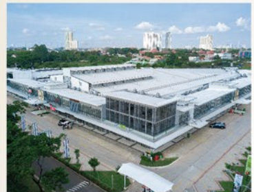
FRESH MARKET BINTARO JAYA