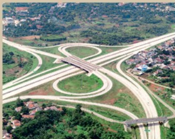
TOL SIMPANG SUSUN PARIGI