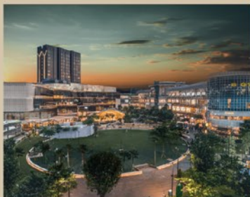
BINTARO XCHANGE MALL