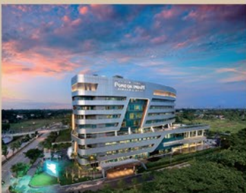
RUMAH SAKIT PONDOK INDAH BINTARO