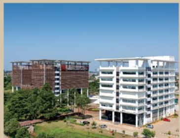
UNIVERSITAS PEMBANGUNAN JAYA