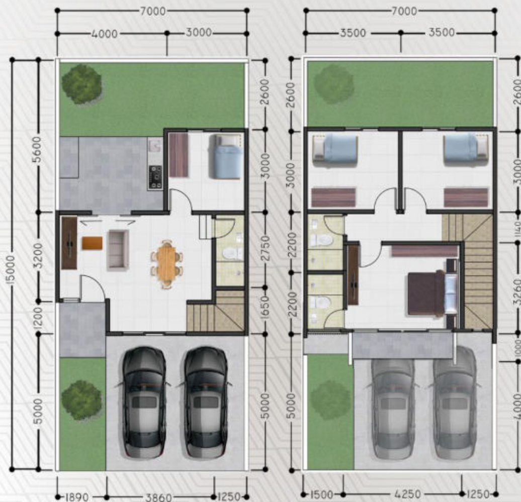
DENAH LT. 1