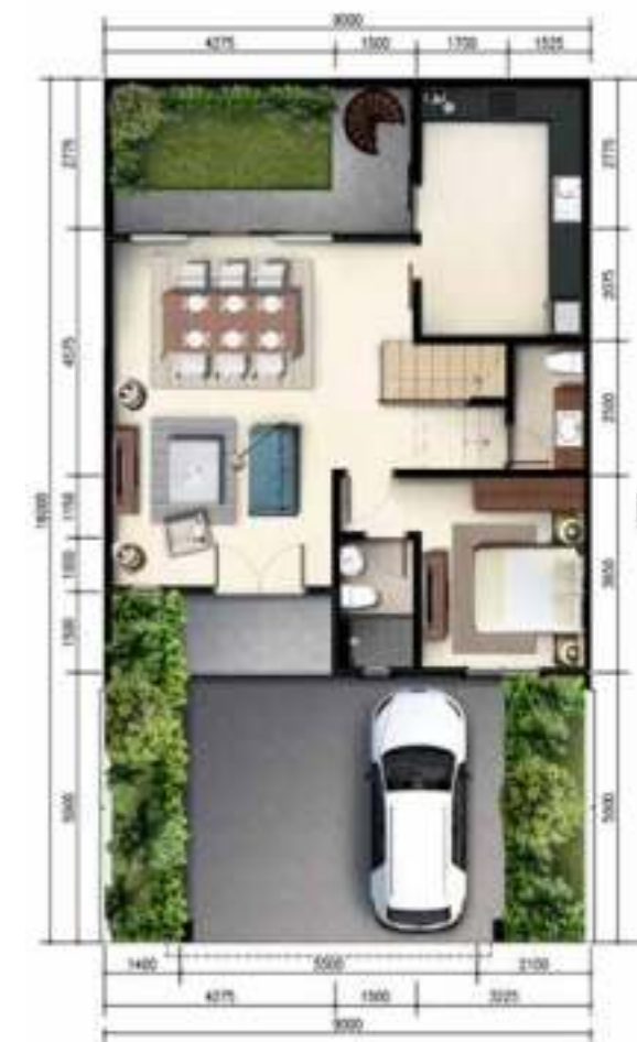
LOWER LEVEL FLOORPLAN

PURI MUTIARA COMBINES LUXURY AND PRACTICALITY TO CREATE EXCEPTIONAL HOMES. EACH UNIT IS DESIGNED WITH FLOWING SPACES, ABUNDANT NATURAL LIGHT, AND QUALITY FITTINGS FOR EVERYDAY LIVING.