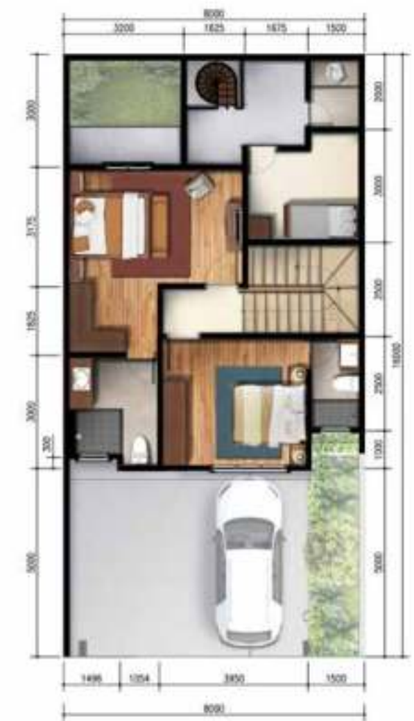
UPPER LEVEL FLOORPLAN