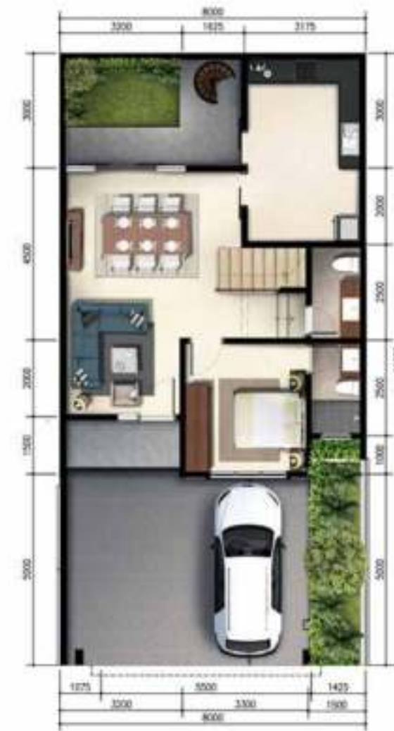
LOWER LEVEL FLOORPLAN

WITH FULL ACCESS TO PURI MUTIARA RESIDENCES' FACILITIES, THE 8x16 UNITS ARE MOST COVETED BY YOUNG PROFESSIONALS & COUPLES WHO SEEK SIMPLICITY AND CONVENIENCE AMID A FULFILLING LIFESTYLE.