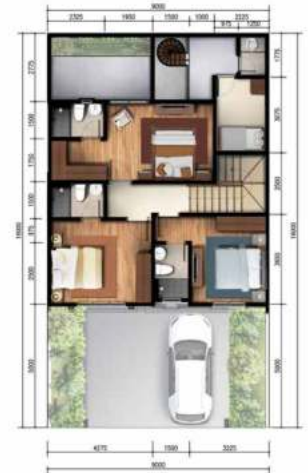
UPPER LEVEL FLOORPLAN