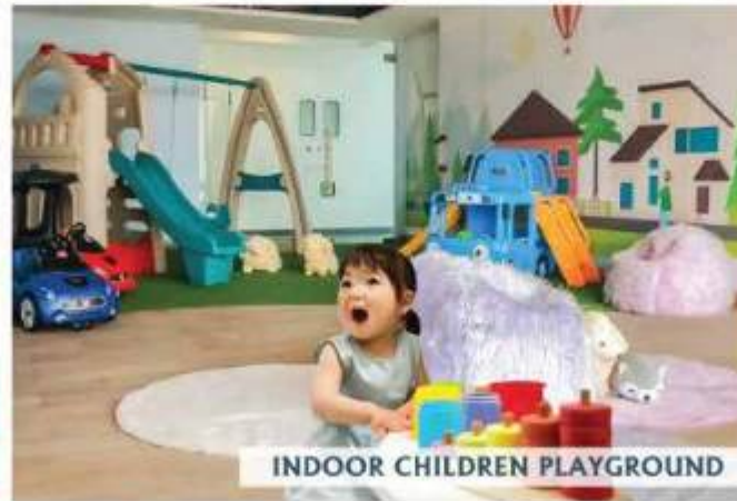
INDOOR CHILDREN PLAYGROUND