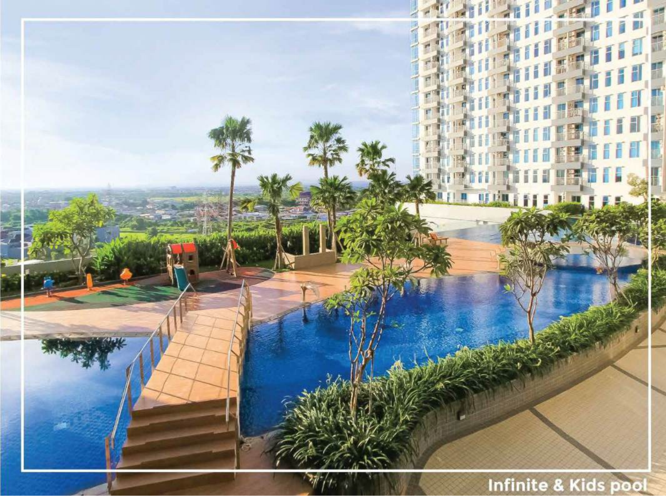
Infinite & Kids pool