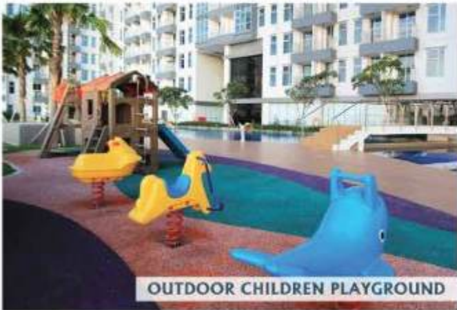
OUTDOOR CHILDREN PLAYGROUND