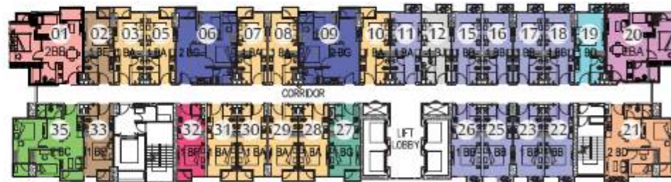
LT. 22, 23, 27