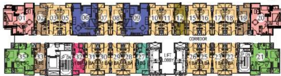
LT. 16, 17