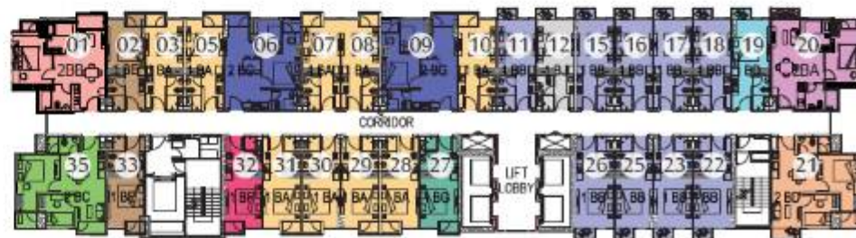
LT. 20, 21, 25, 26, 29, 30