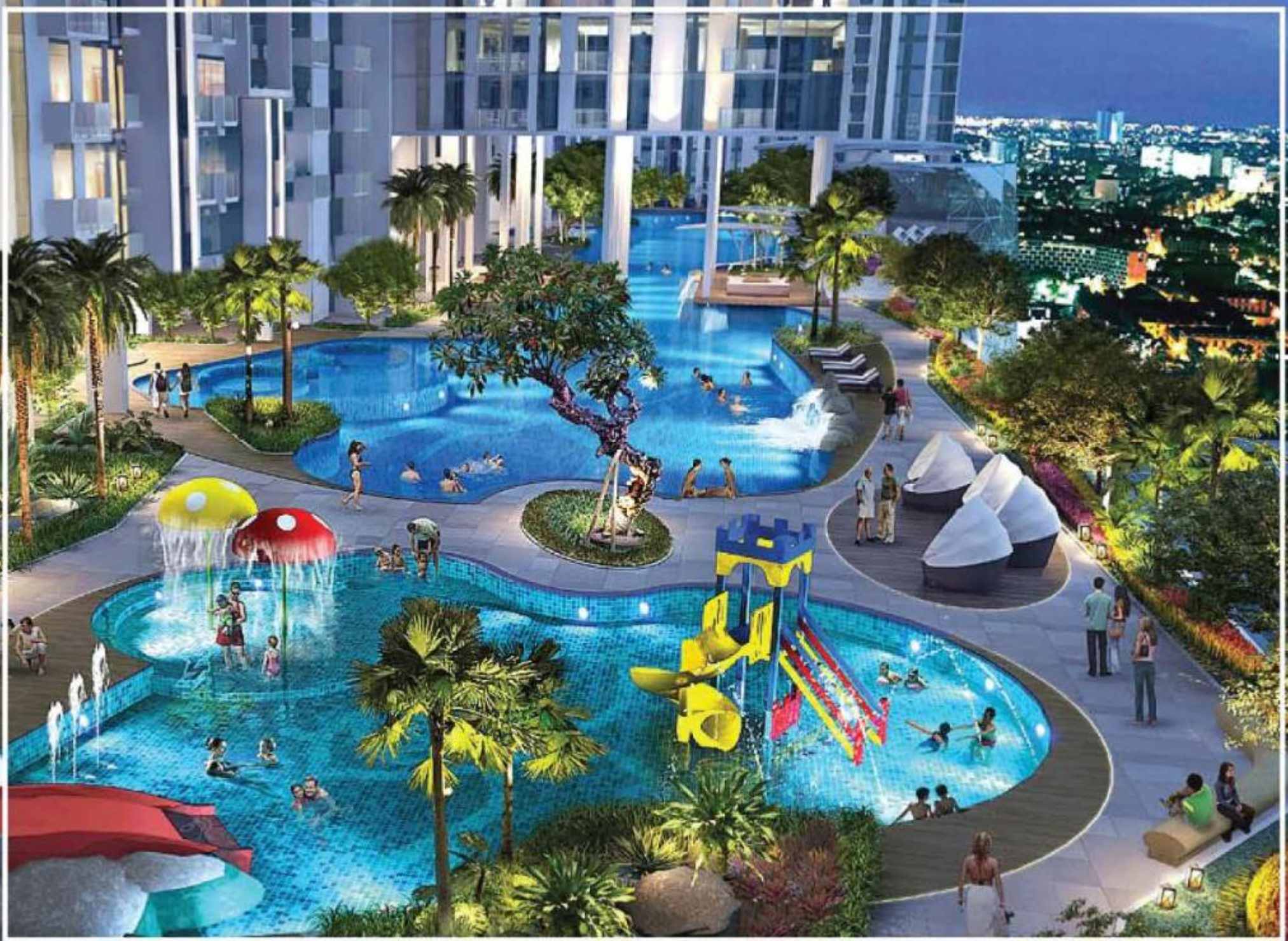
Leisure pool & Kids pool