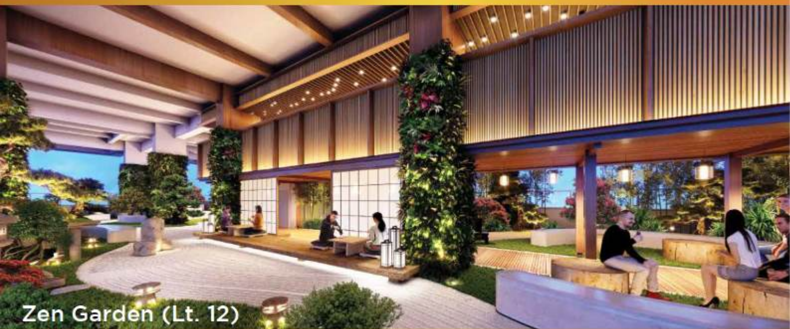
Zen Garden (Lt. 12)