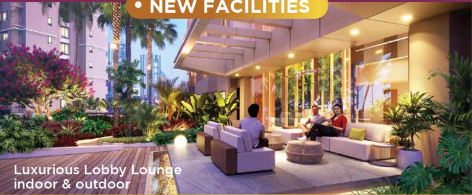
Luxurious Lobby Lounge indoor & outdoor