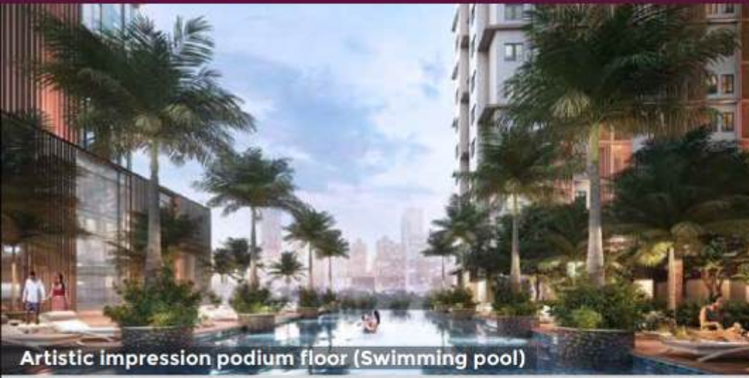
Artistic impression podium floor (Swimming pool)