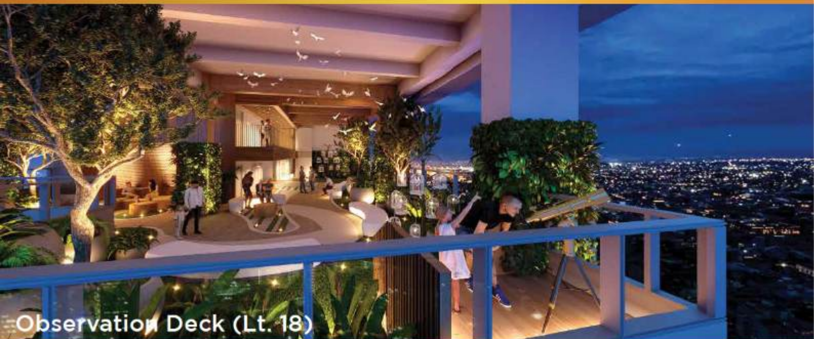
Observation Deck (Lt. 18)