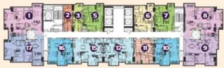
LT. 3, 5, 6, 7, 8, 9, 10, 11, 16, 17, 20, 21, 22, 23, 25, 26, 27, 28, 29, 30