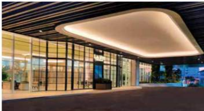
DROP OFF LOBBY