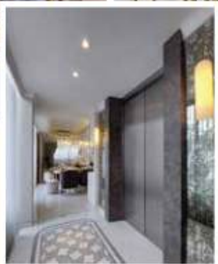
WITH PRIVATE LIFT UNIT