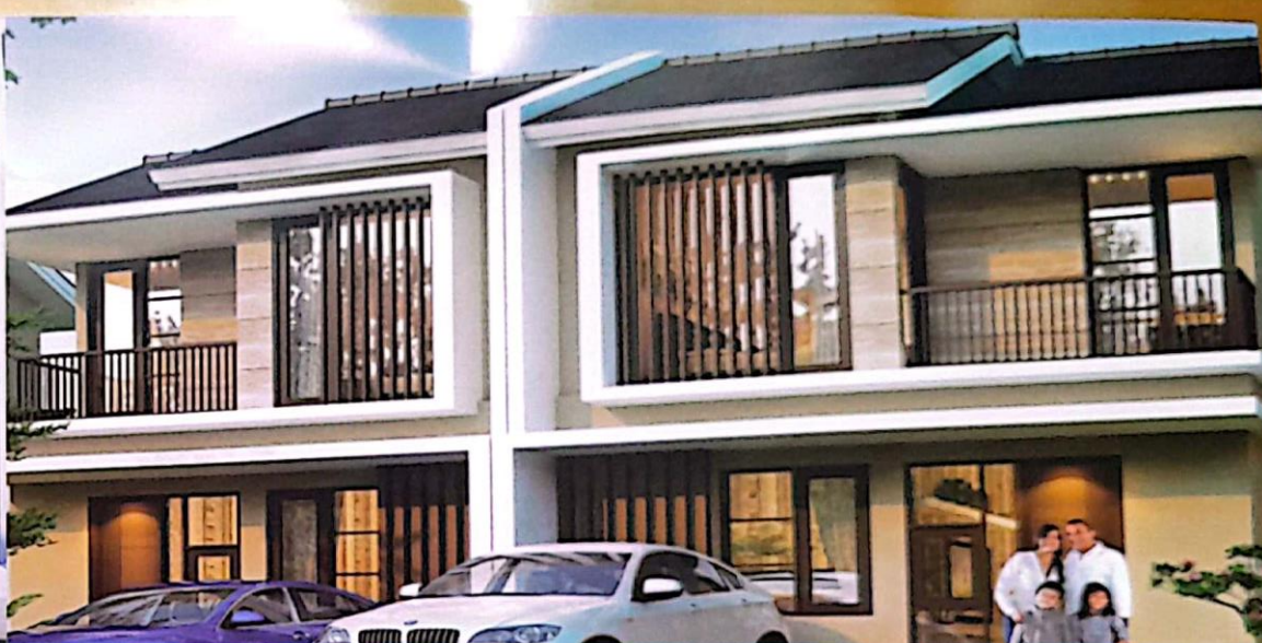
TYPE MODERN BALI