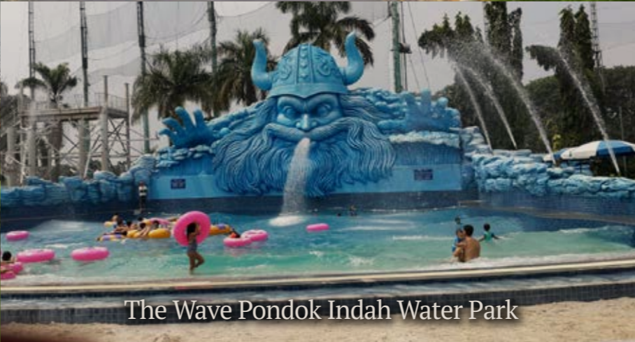
The Wave Pondok Indah Water Park