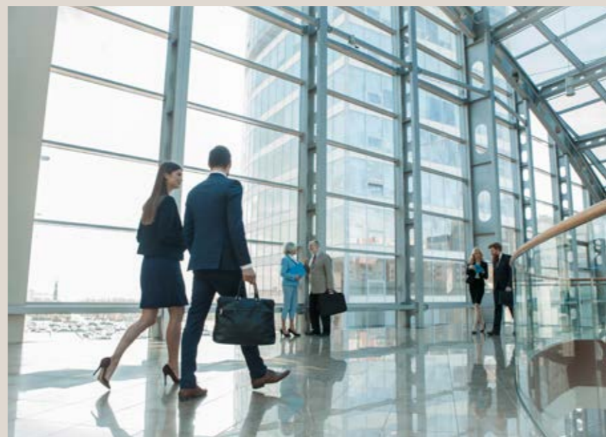
Pondok Indah Office Tower