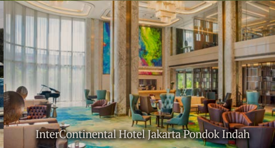
InterContinental Hotel Jakarta Pondok Indah