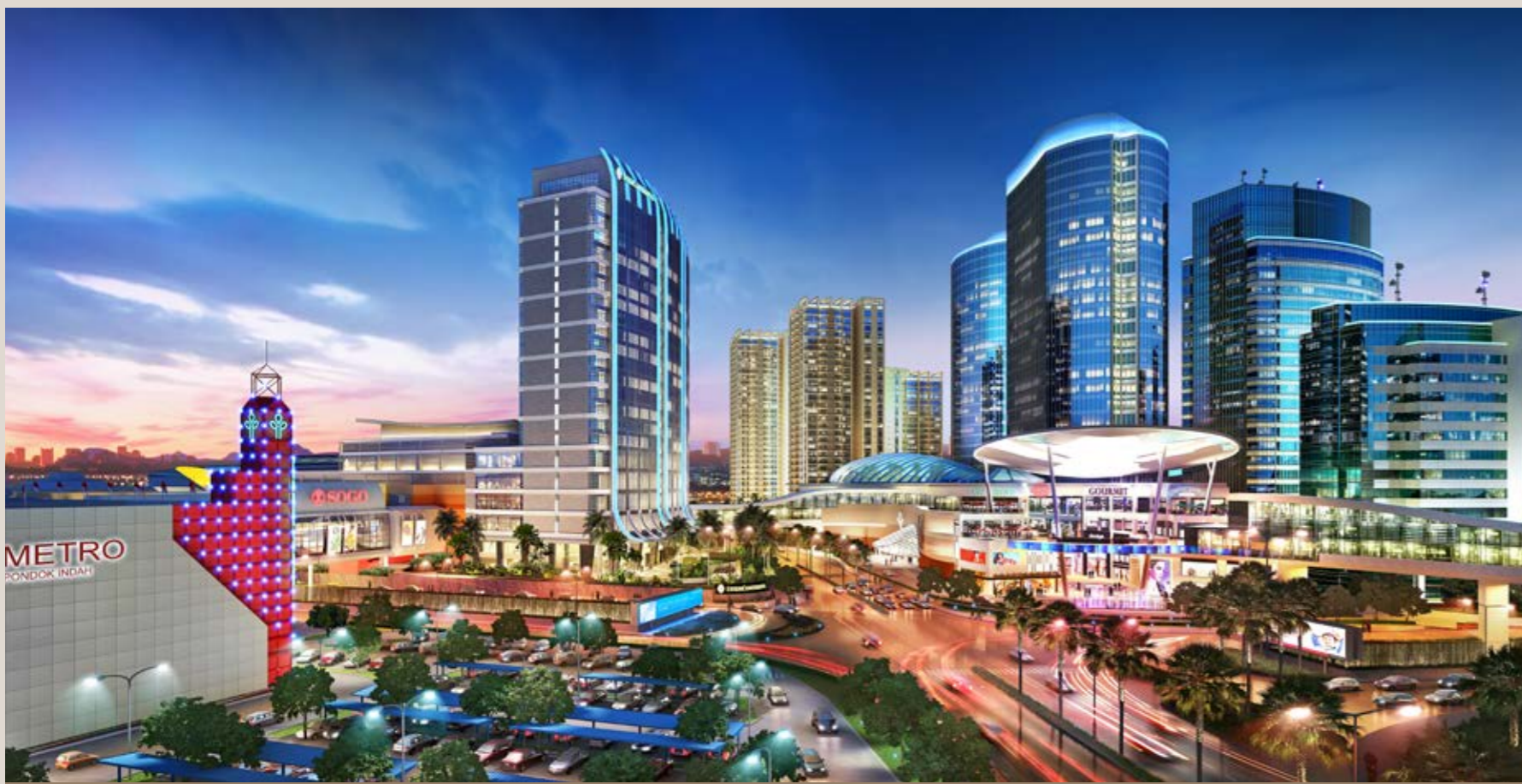
Pondok Indah City Center