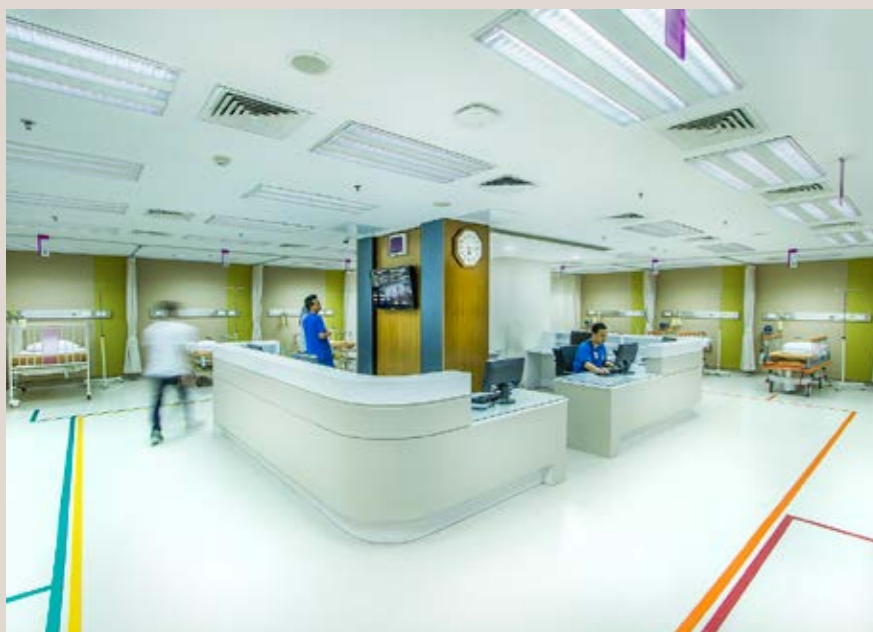
Rumah Sakit Pondok Indah