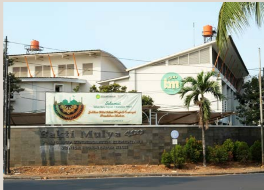
Sekolah Bakti Mulya 400