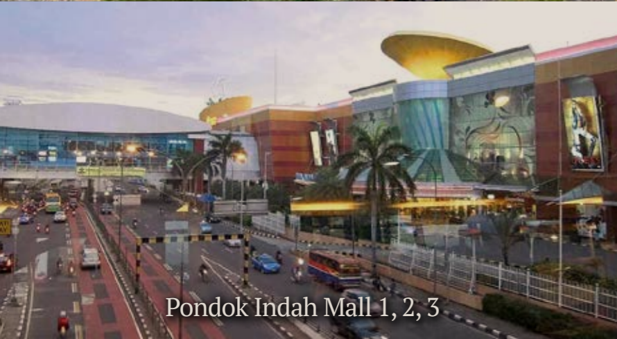
Pondok Indah Mall 1, 2, 3