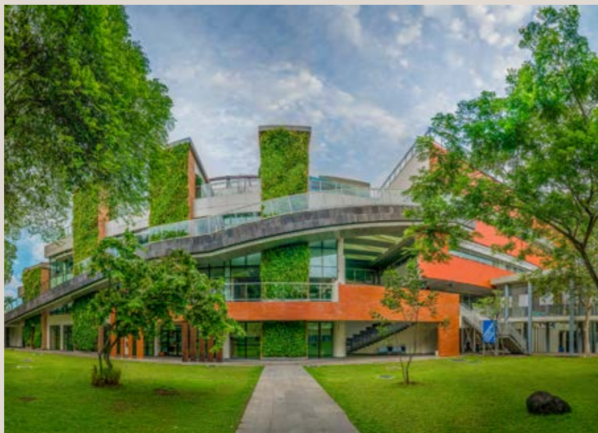
Jakarta Intercultural School