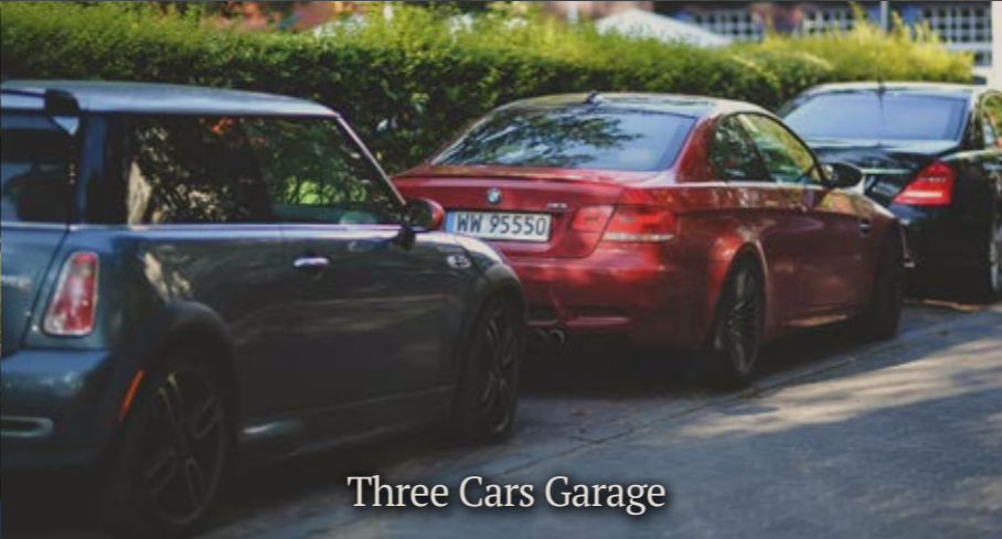
Three Cars Garage