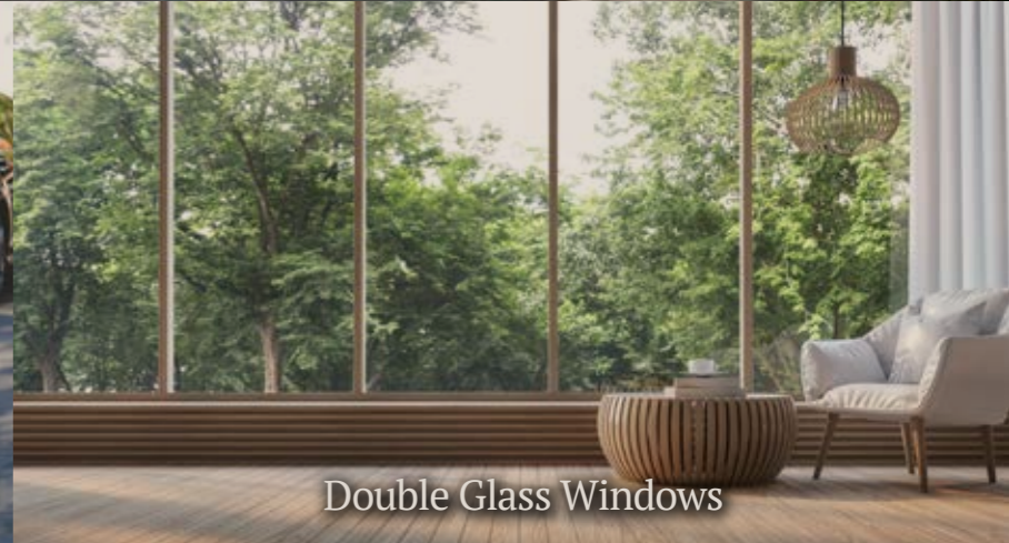
Double Glass Windows