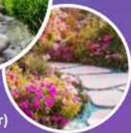
THE FLORE PATH (a space to grow together)