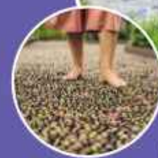
SPATIAL PARK (the quality of space)