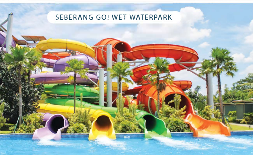
SEBERANG GO! WET WATERPARK