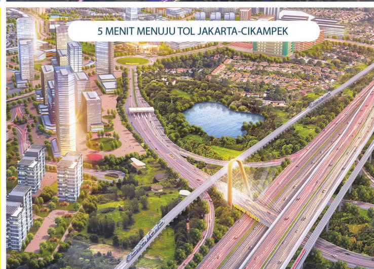
5 MENIT MENUJU TOL JAKARTA-CIKAMPEK