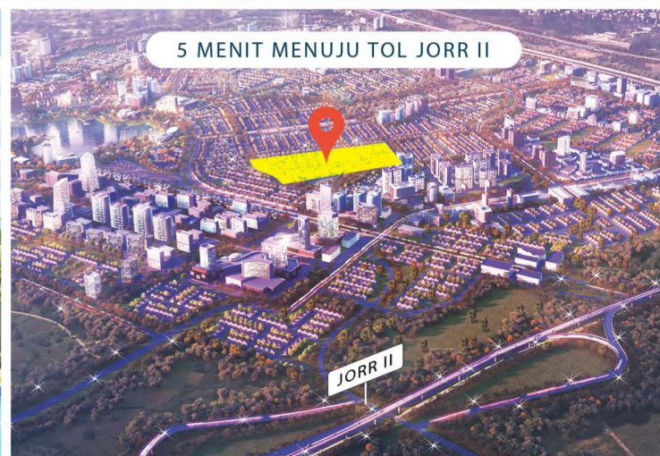
5 MENIT MENUJU TOL JORR II