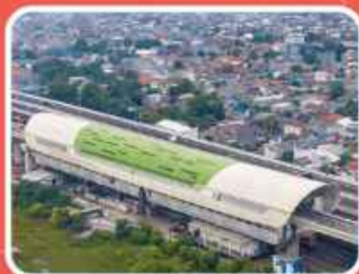
LRT Operating July 2023