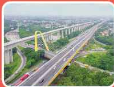
Elevated Toll Ready 100%