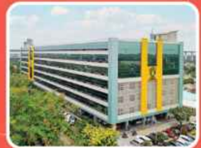
Fasilitas Kesehatan Lengkap