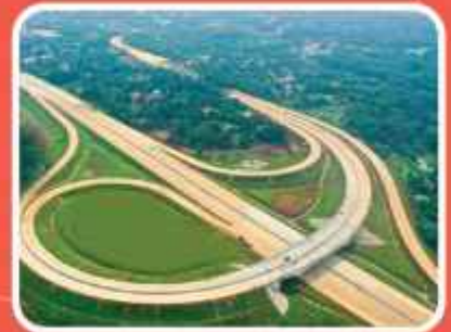
Toll JORR II Operating 2024