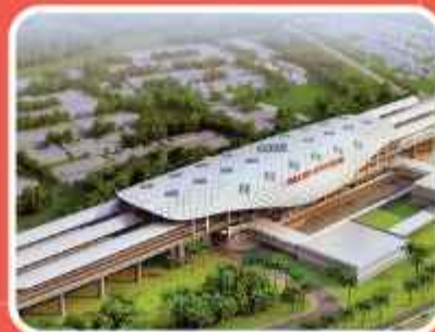
KCIC Operating August 2023