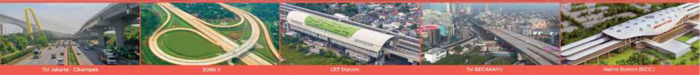
Tol Jakarta - Cikampek