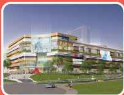
Mall Living World Ready 2024

Beli rumah di Grand Wisata, dengan fasilitas yang SUDAH LENGKAP !