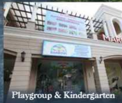
Playgroup & Kindergarten