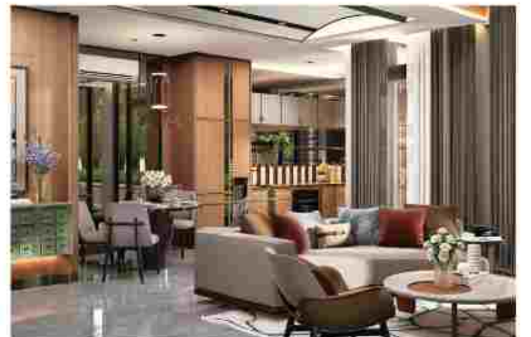
LIVING DINING KITCHEN