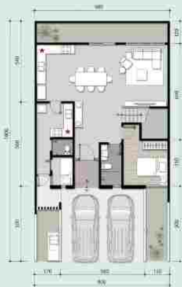
1 ST F