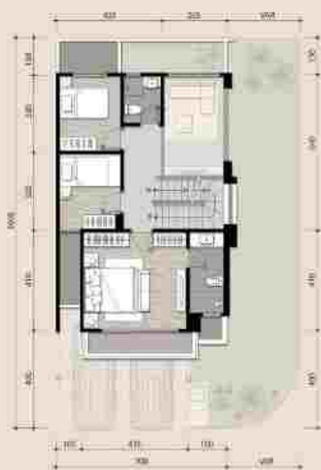
2 ND F