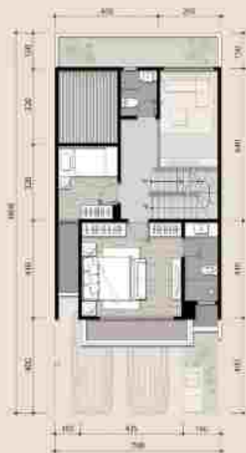
2 ND F