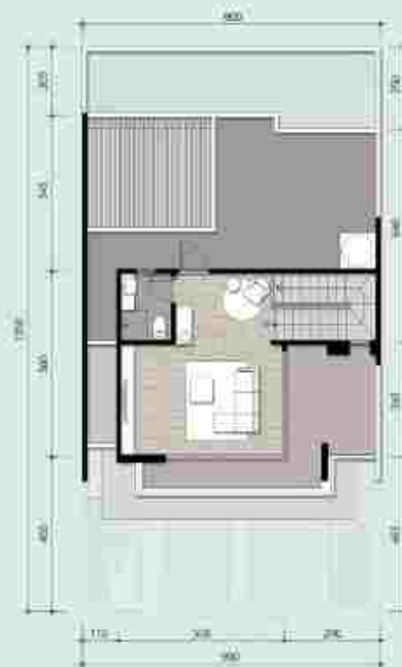
3 RD F