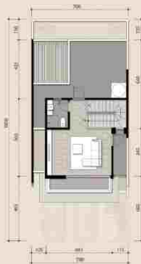
3 RD F