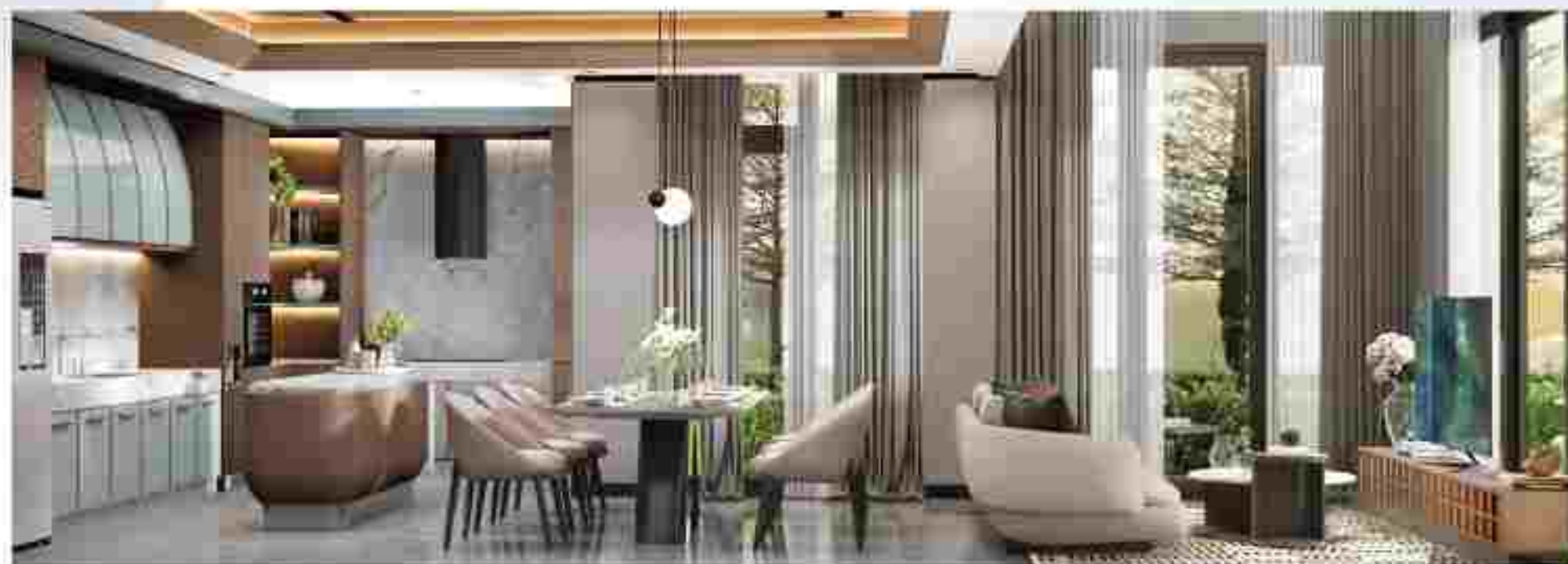
LIVING DINING KITCHEN