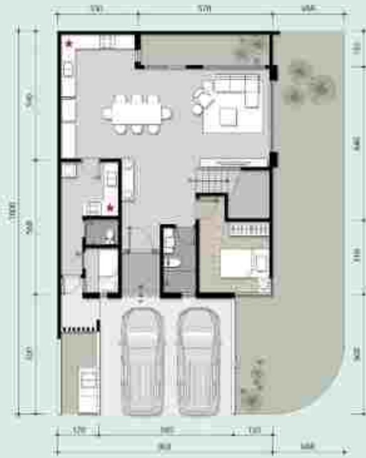
1 ST F