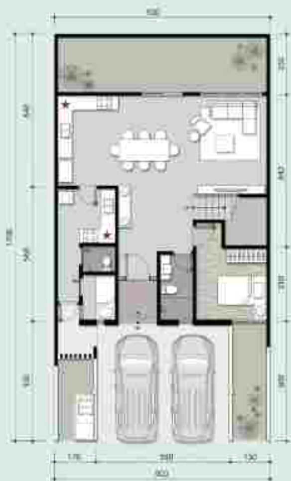
1 ST F