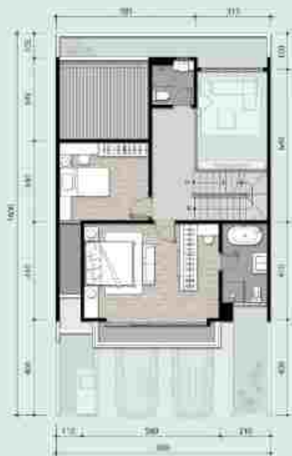
2 ND F