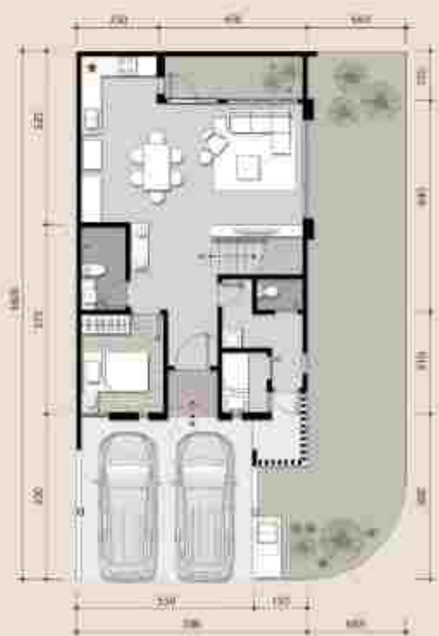
1 ST F