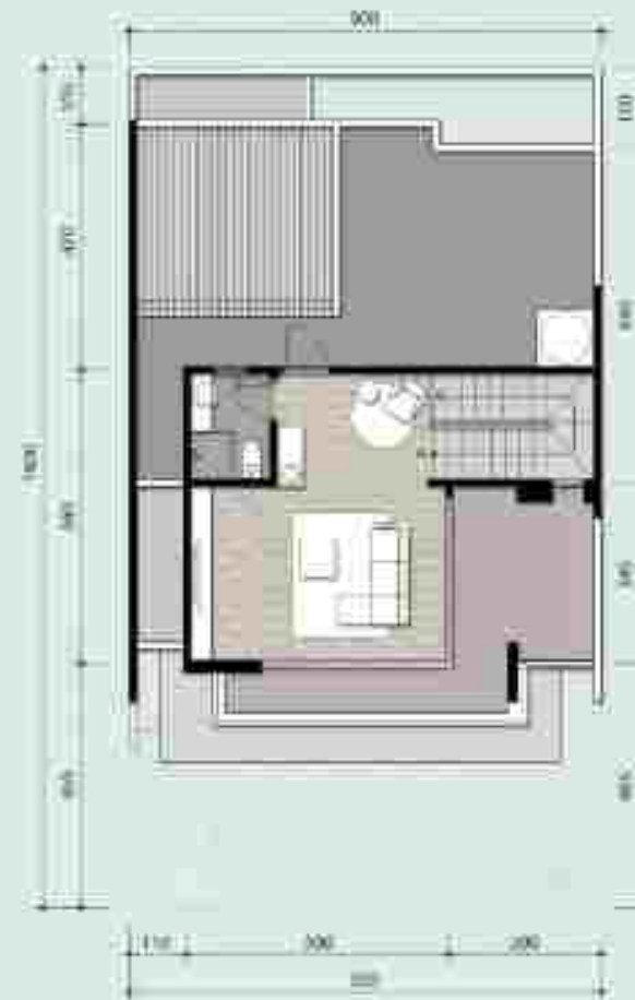
3 RD F

★ CONCRETE EXISTING ONLY THIS APPROX. IT'S NOT FOR EXECUTION. THE POSITIONS MAY BECHANGED.