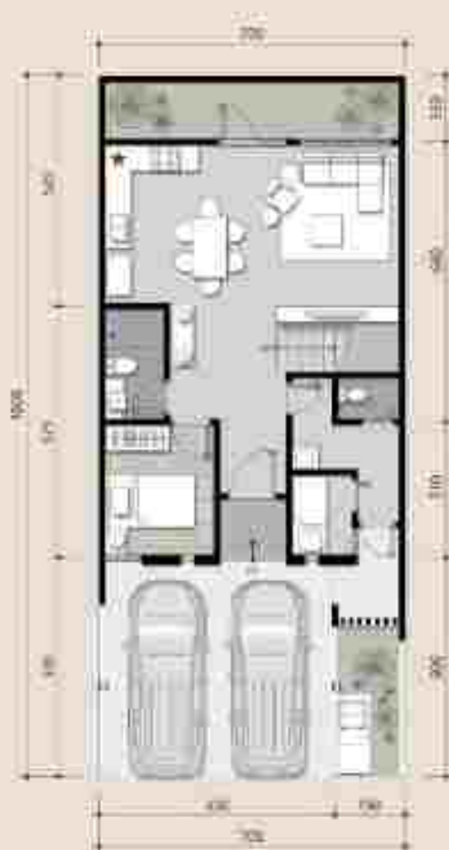
1 ST F