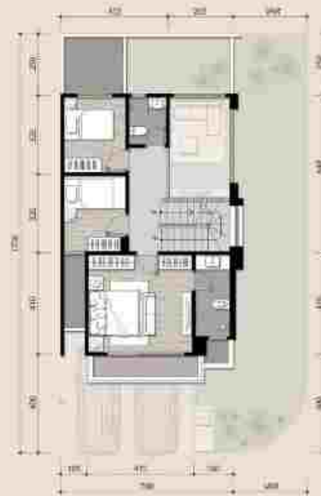
2 ND F