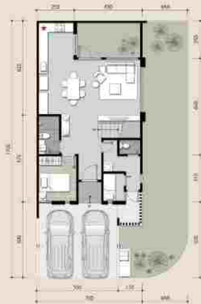
1 ST F