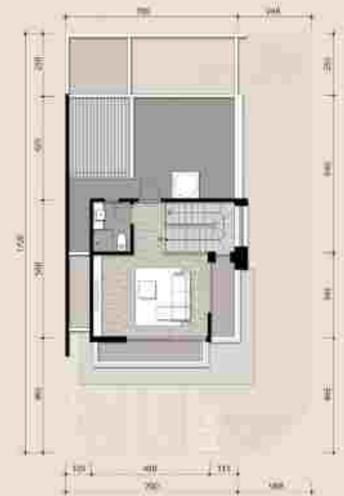
3 RD F

★ CONCRETE CONCRETEWORK AND ROOFING ARE NOT INCLUDED IN THE ESTIMATED BUILT-UP AREA