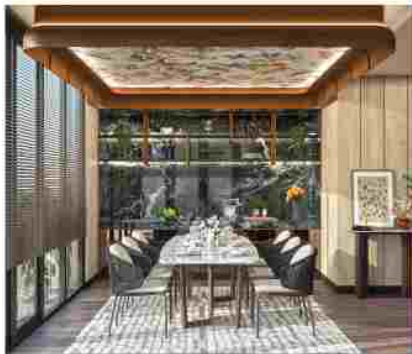
5 TH FLOOR