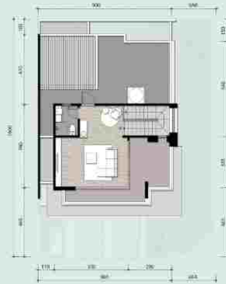
3 RD F

★ CONCRETE EXISTING ONLY THIS APPROX. IT'S NOT FOR EXECUTION. THE POSITIONS MAY BECHANGED.