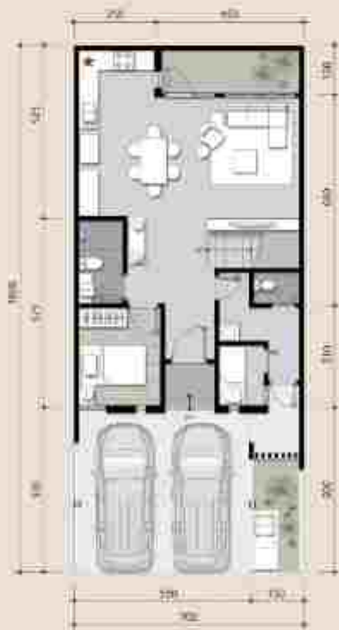
1 ST F