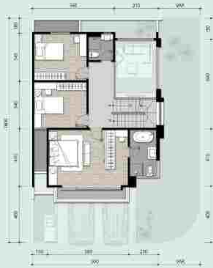
2 ND F