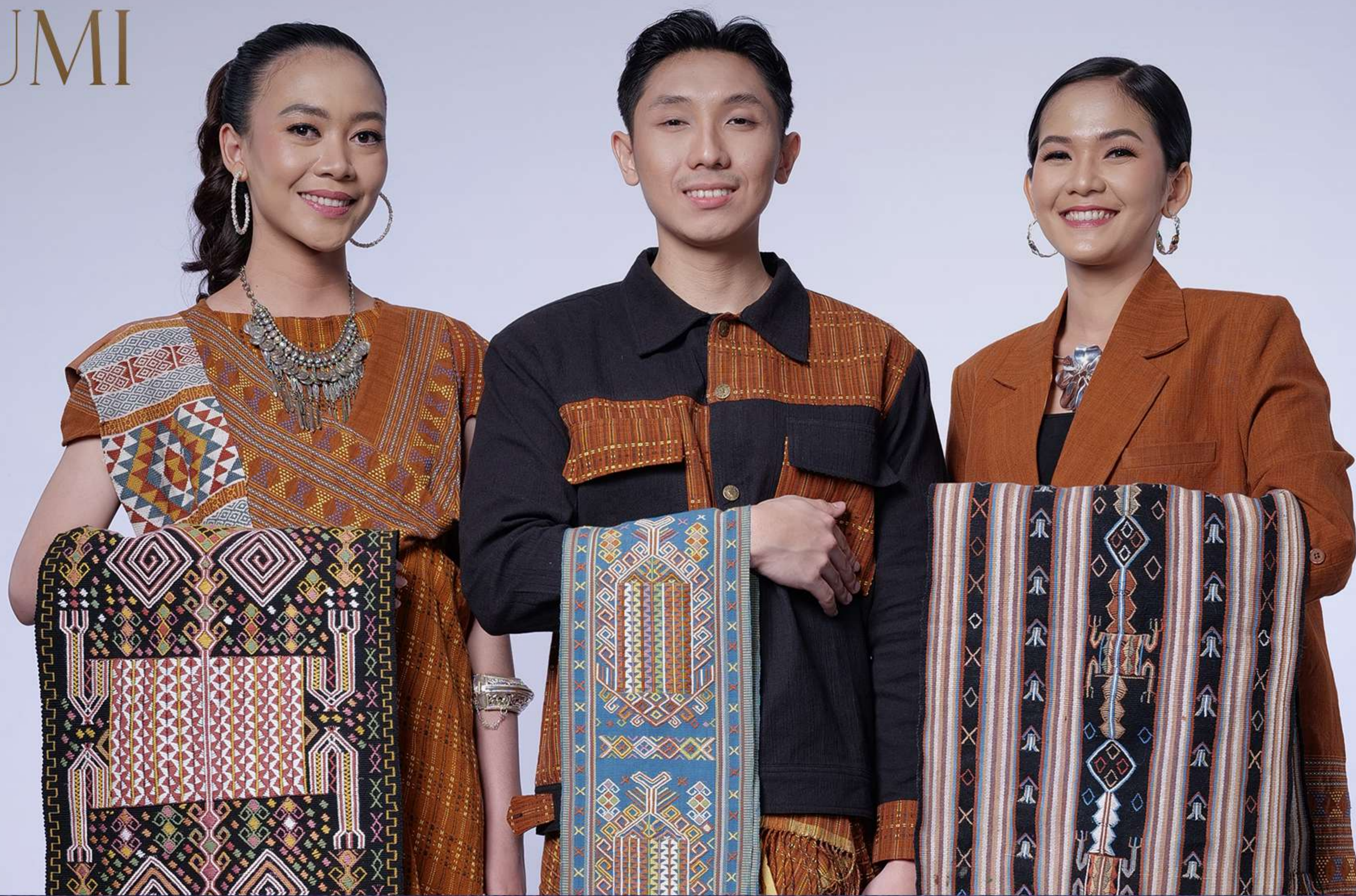
Clothing Set Wastra